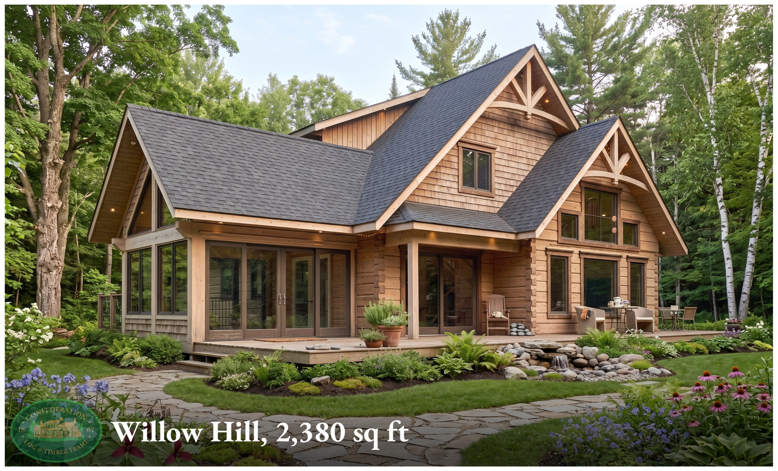
Willow Hill, 2,380 sq ft