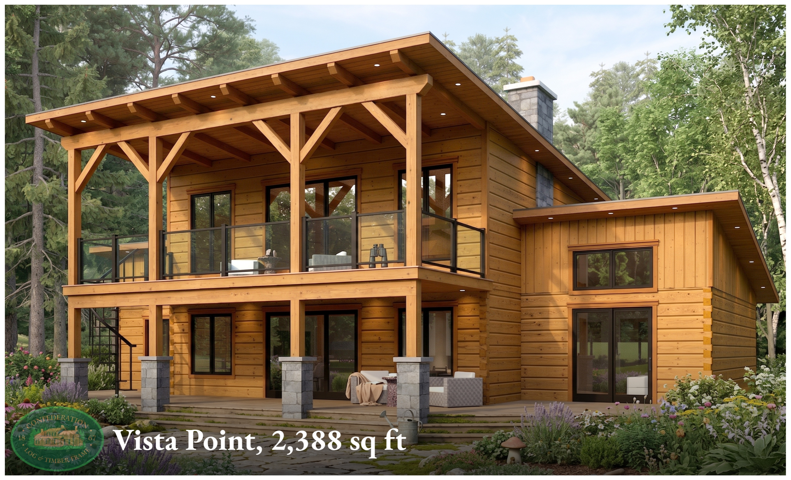
Vista Point, 2,388 sq ft