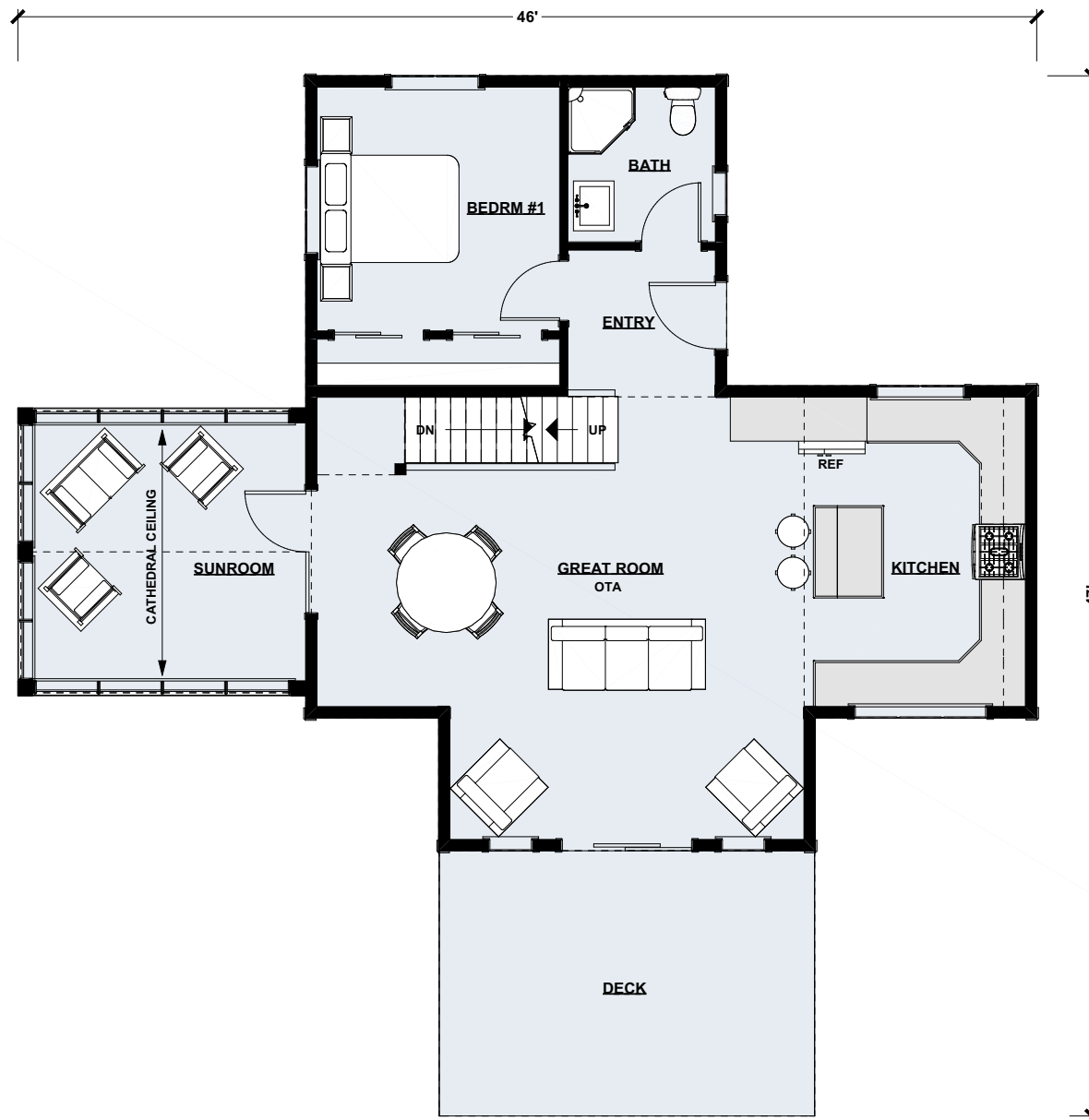
Main Floor Plan | 1,000 sq ft