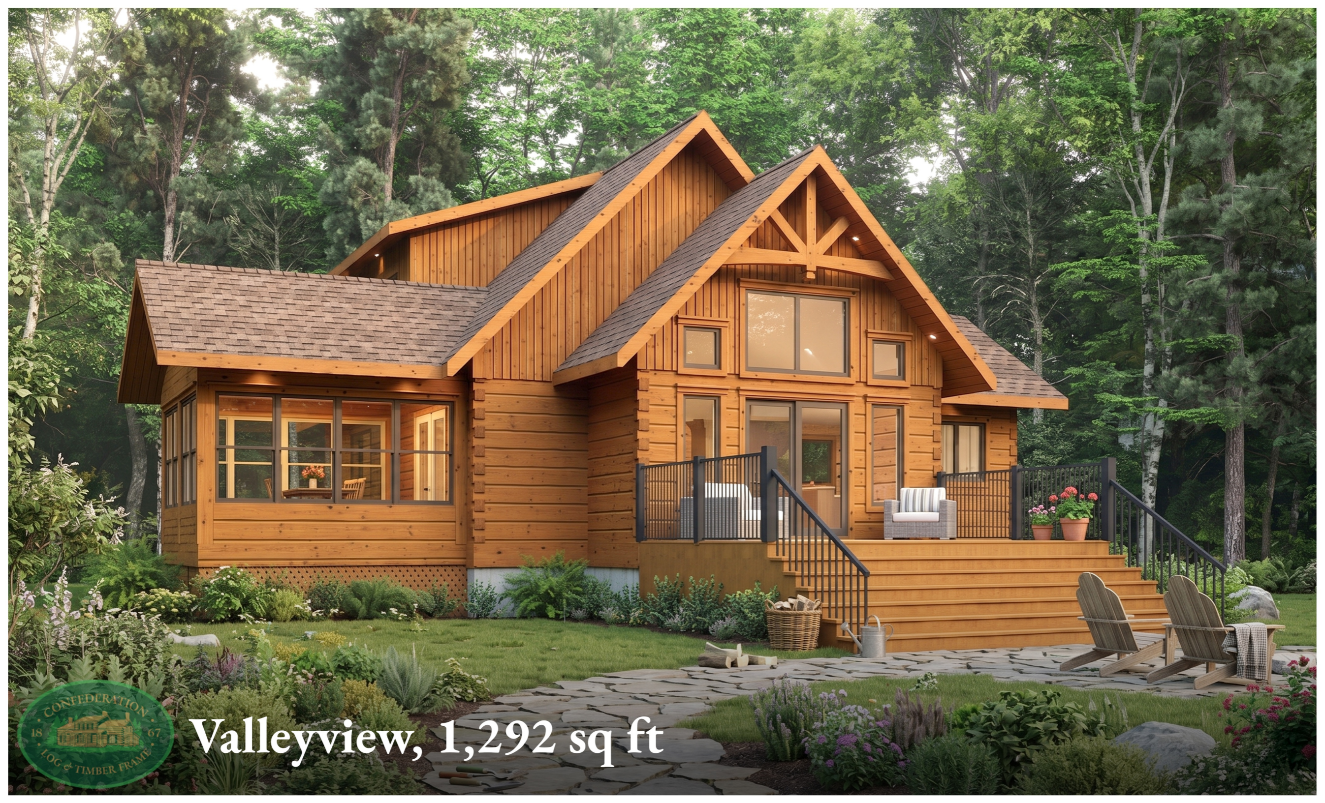
Valleyview, 1,292 sq ft