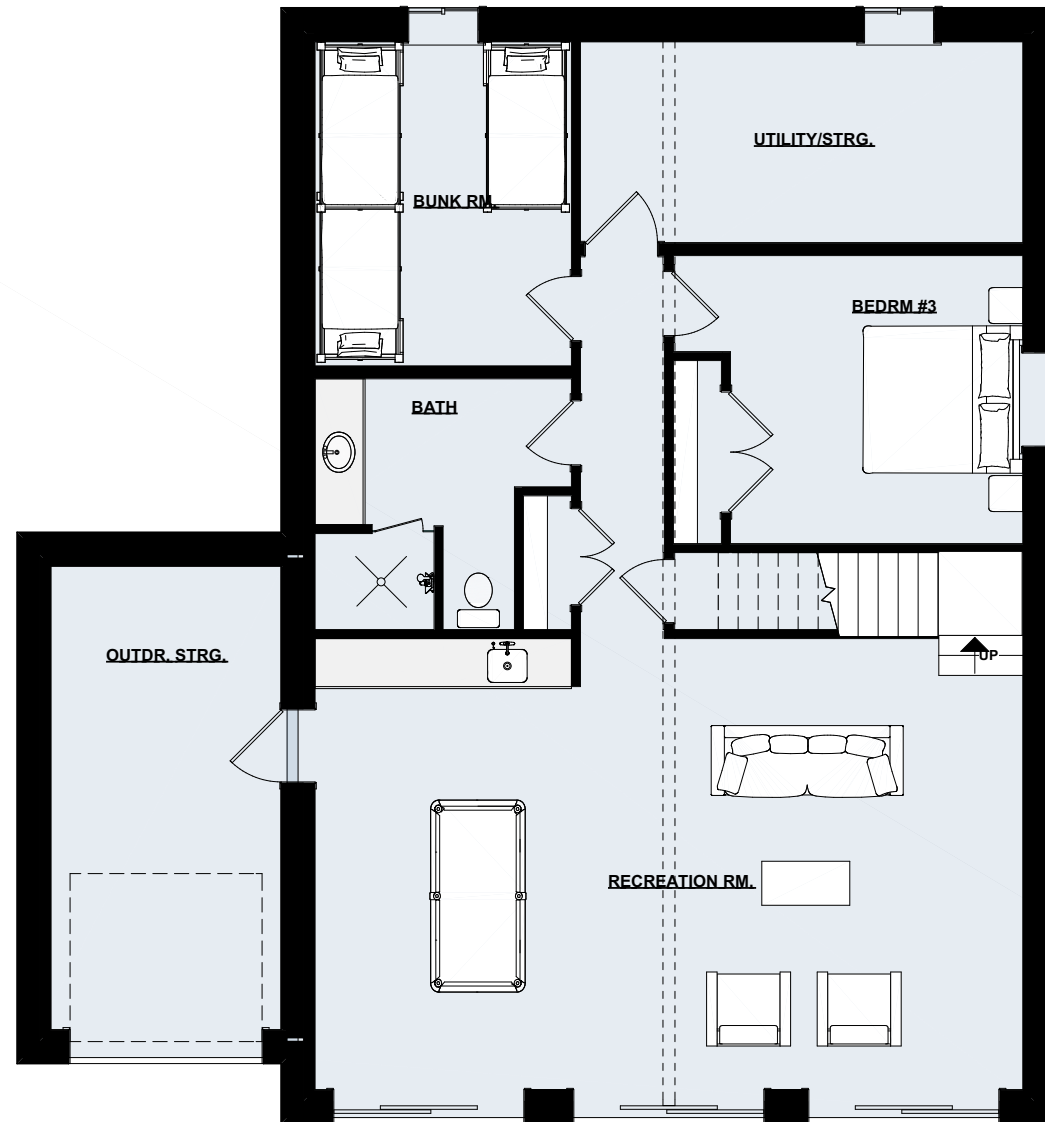
Lower Floor Plan | 1,471 sq ft