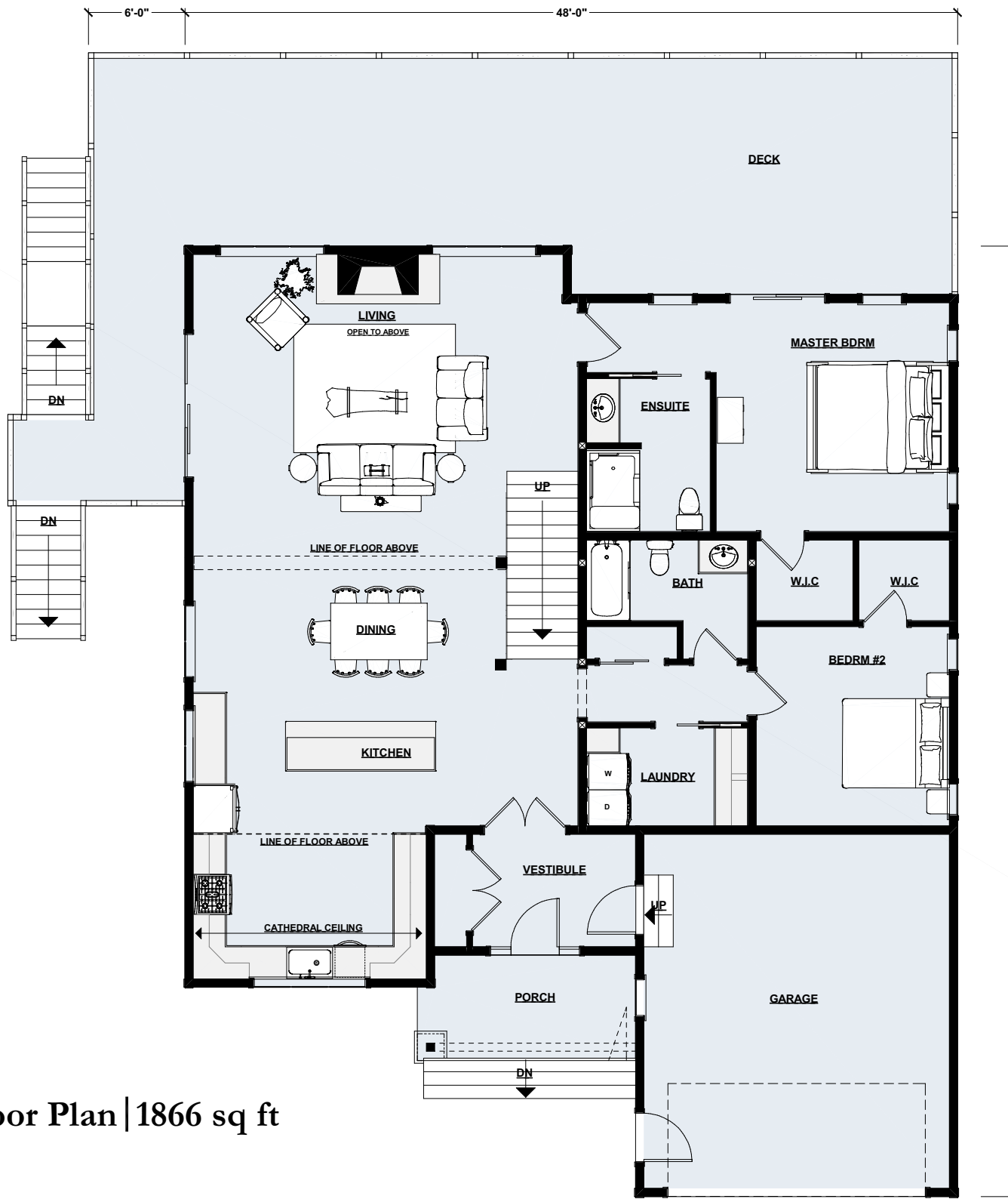
Main Floor Plan | 1866 sq ft