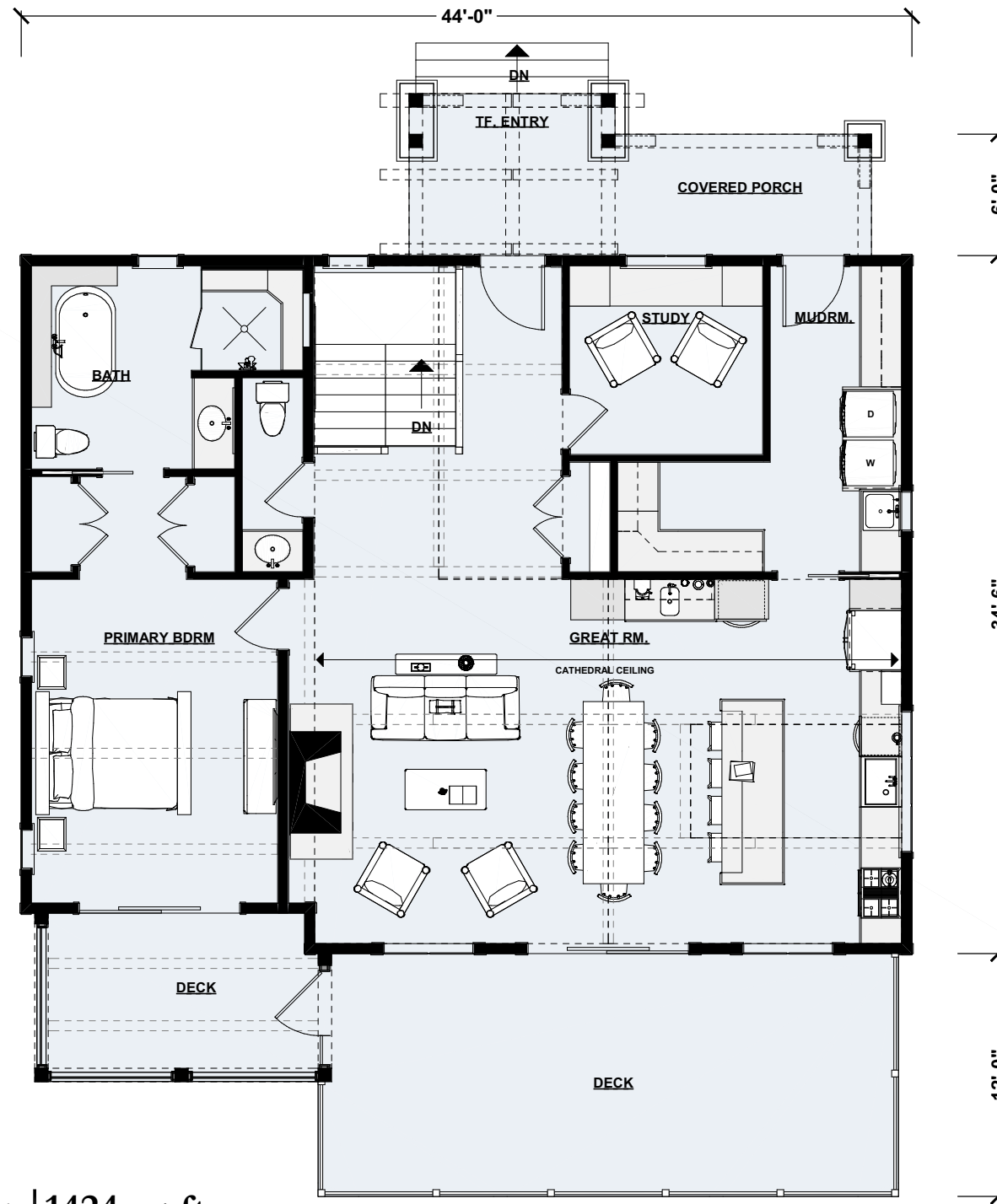
Main Floor Plan | 1424 sq ft