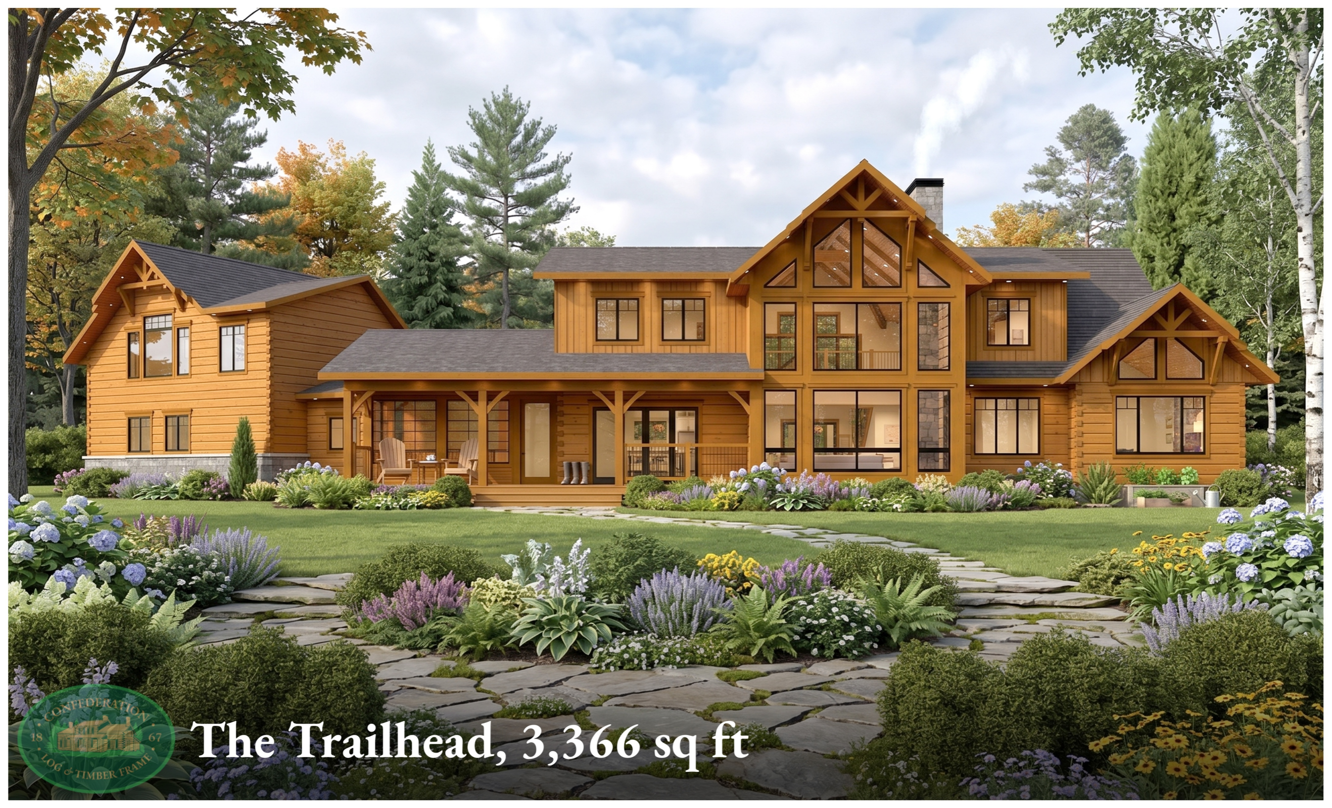
The Trailhead, 3,366 sq ft