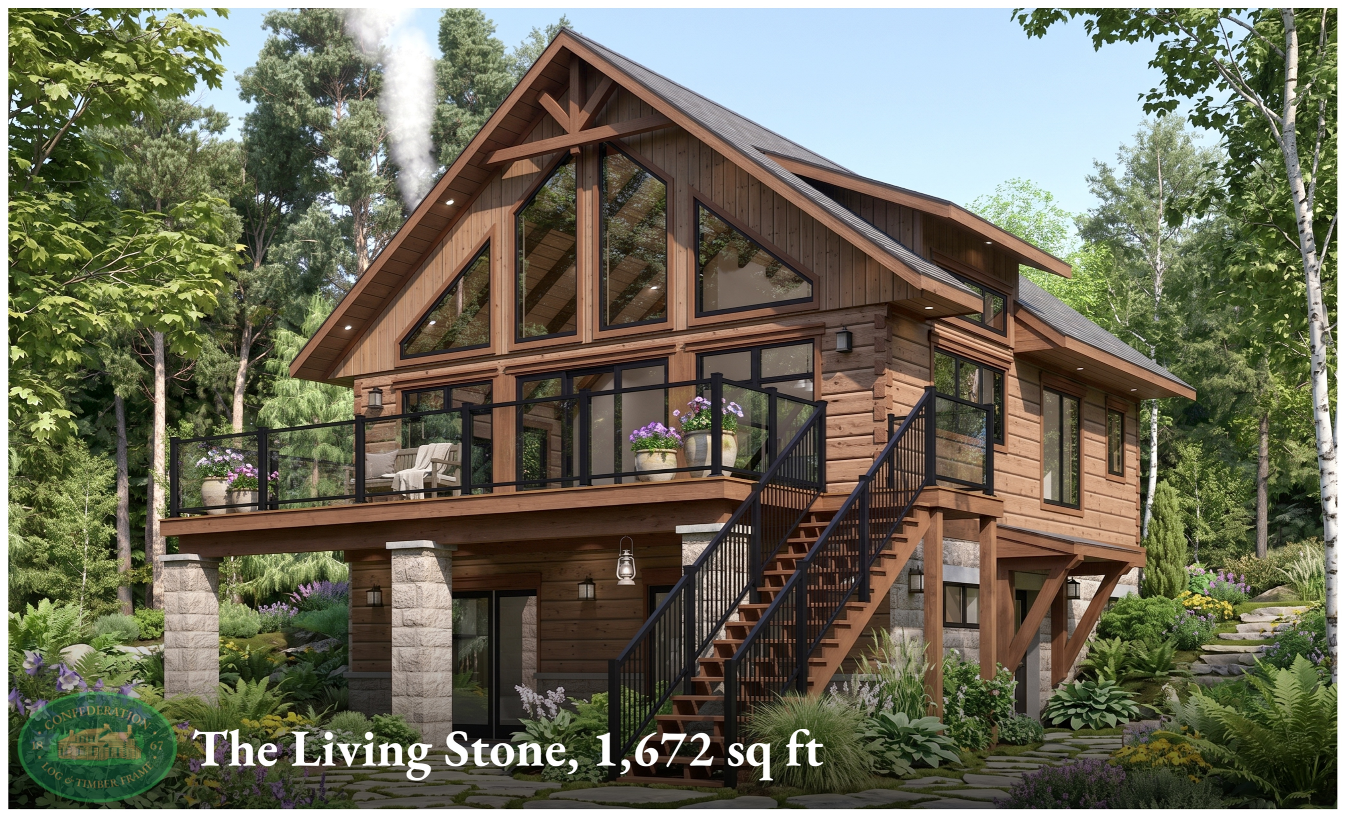
The Living Stone, 1,672 sq ft