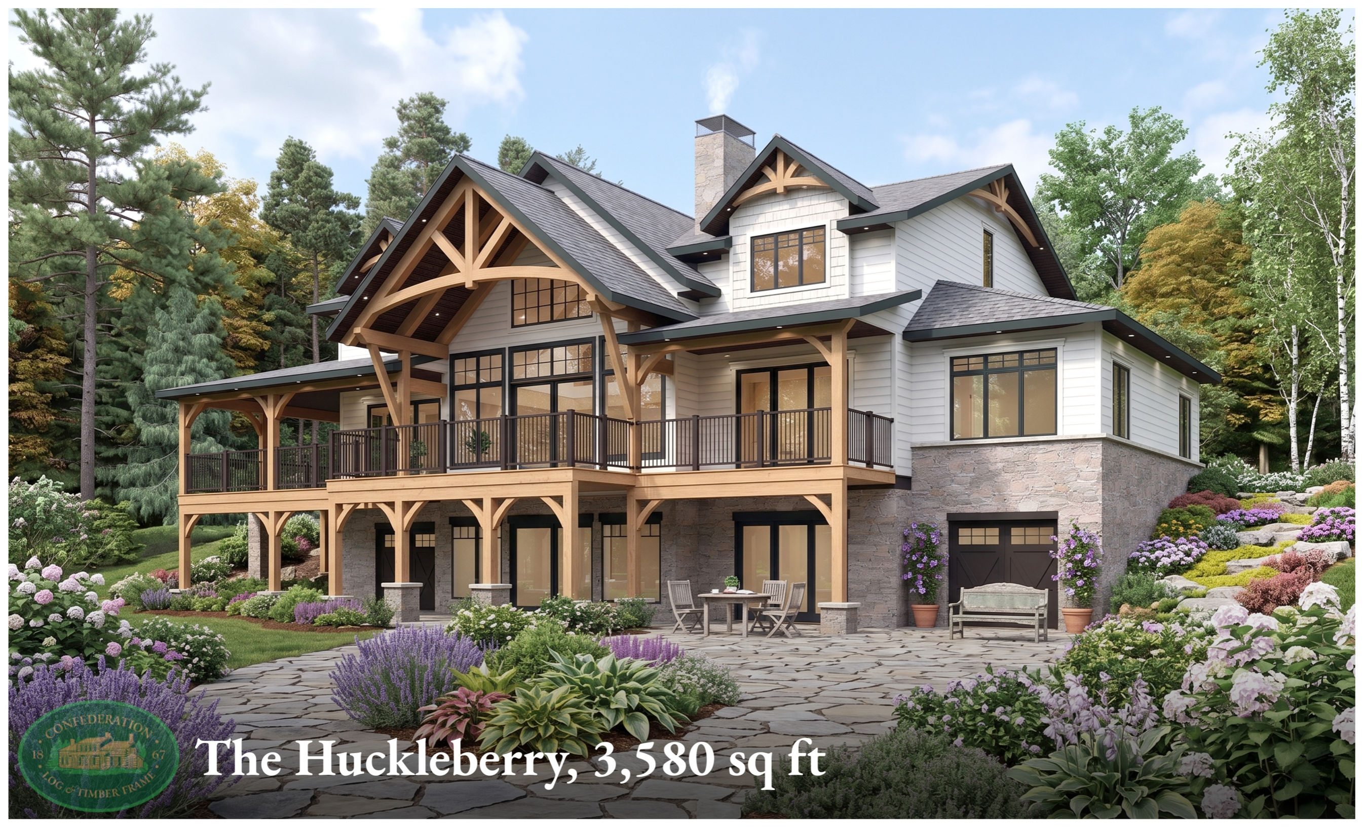
The Huckleberry, 3,580 sq ft