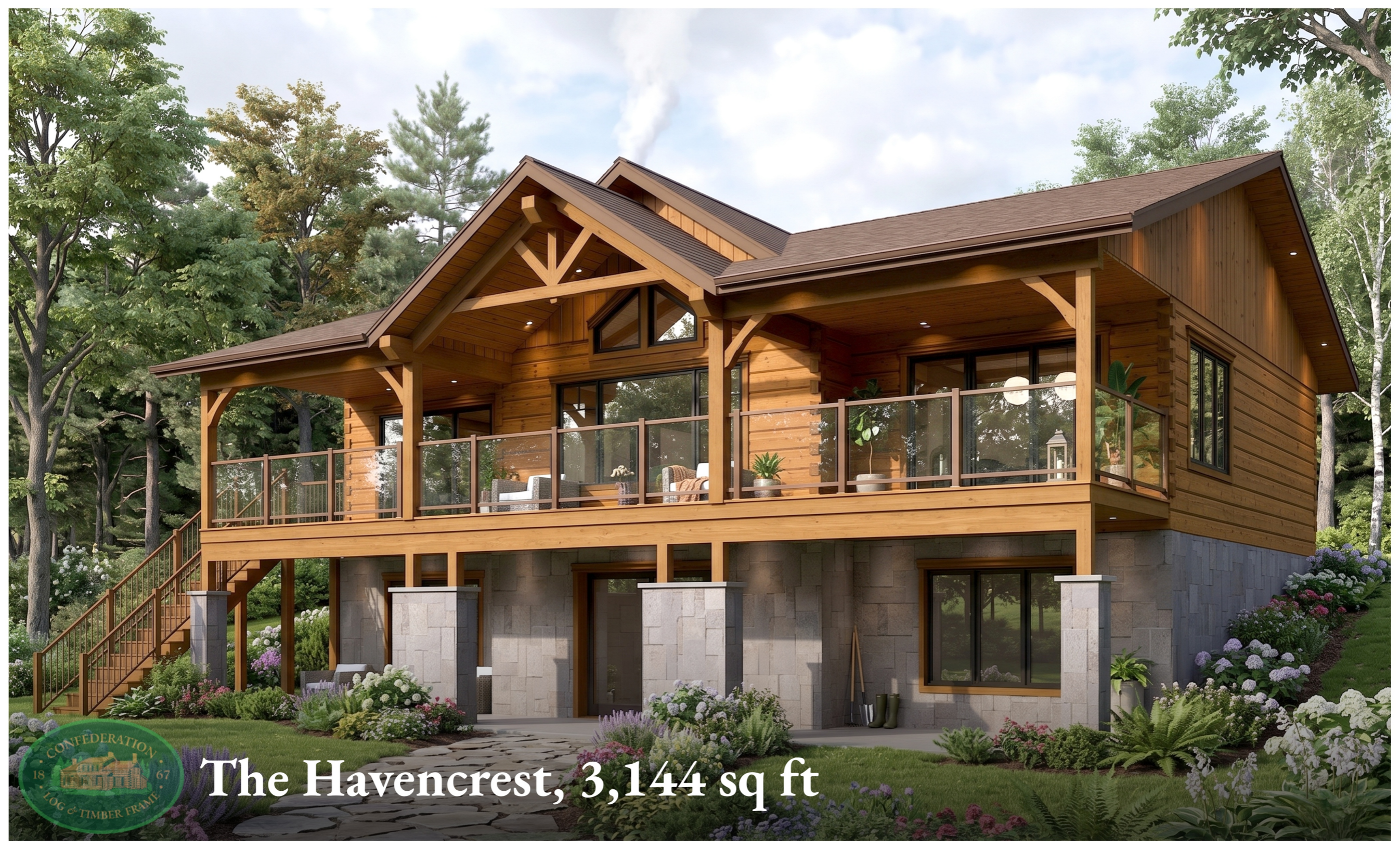
The Havencrest, 3,144 sq ft