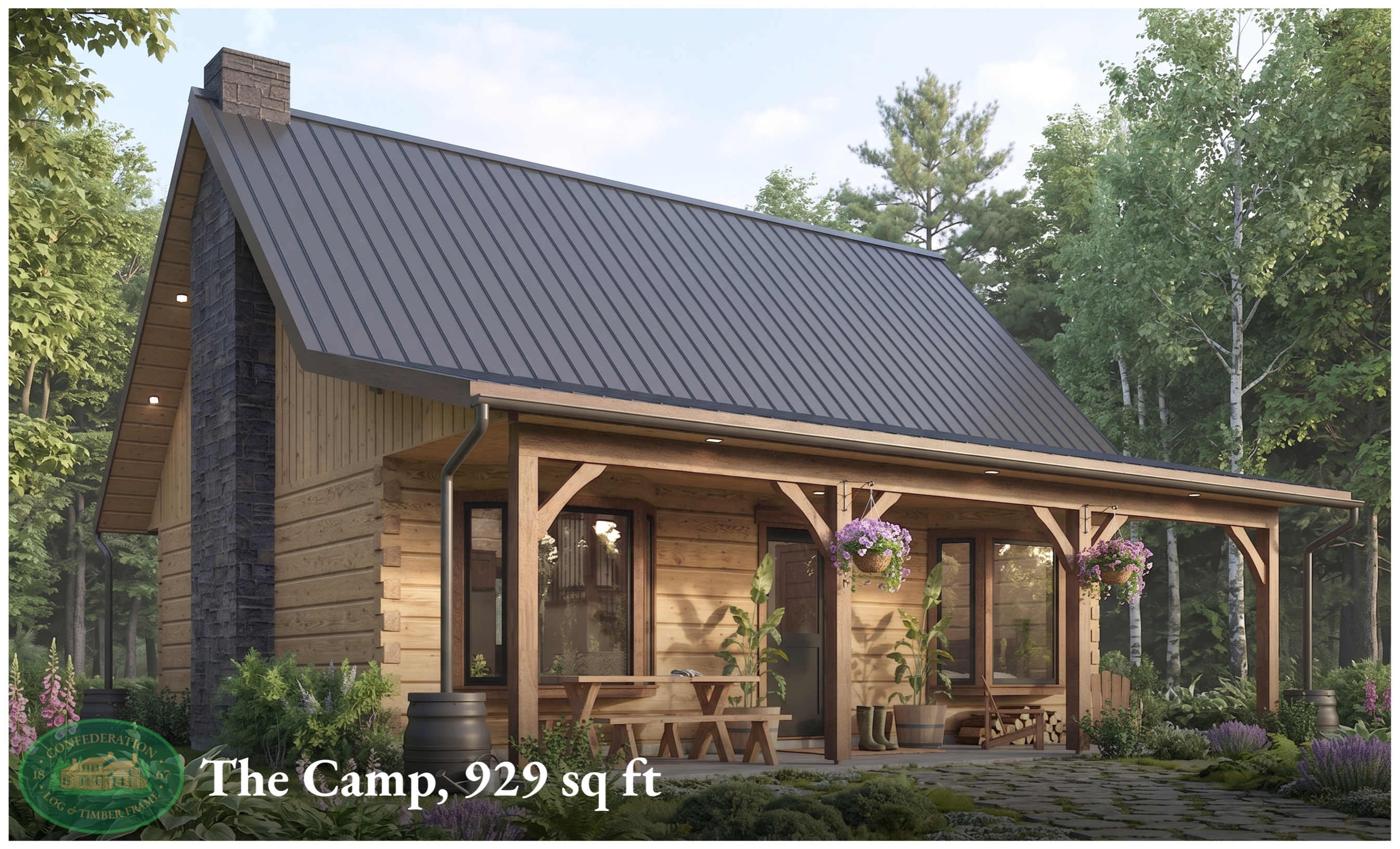
The Camp, 929 sq ft