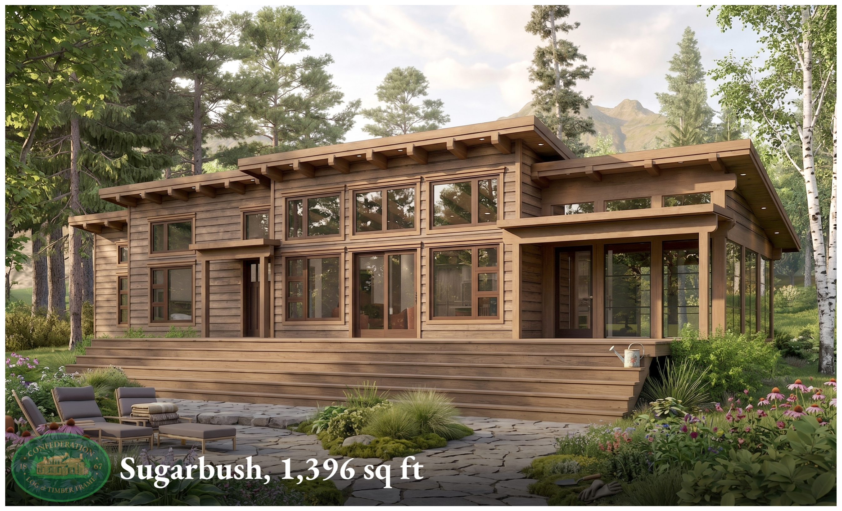
Sugarbush, 1,396 sq ft