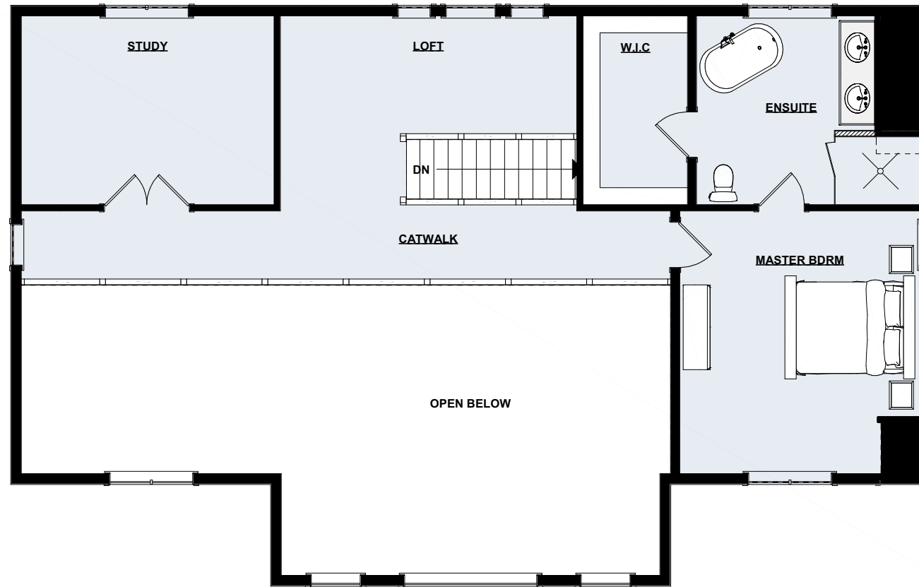
Upper Floor Plan | 1,025 sq ft