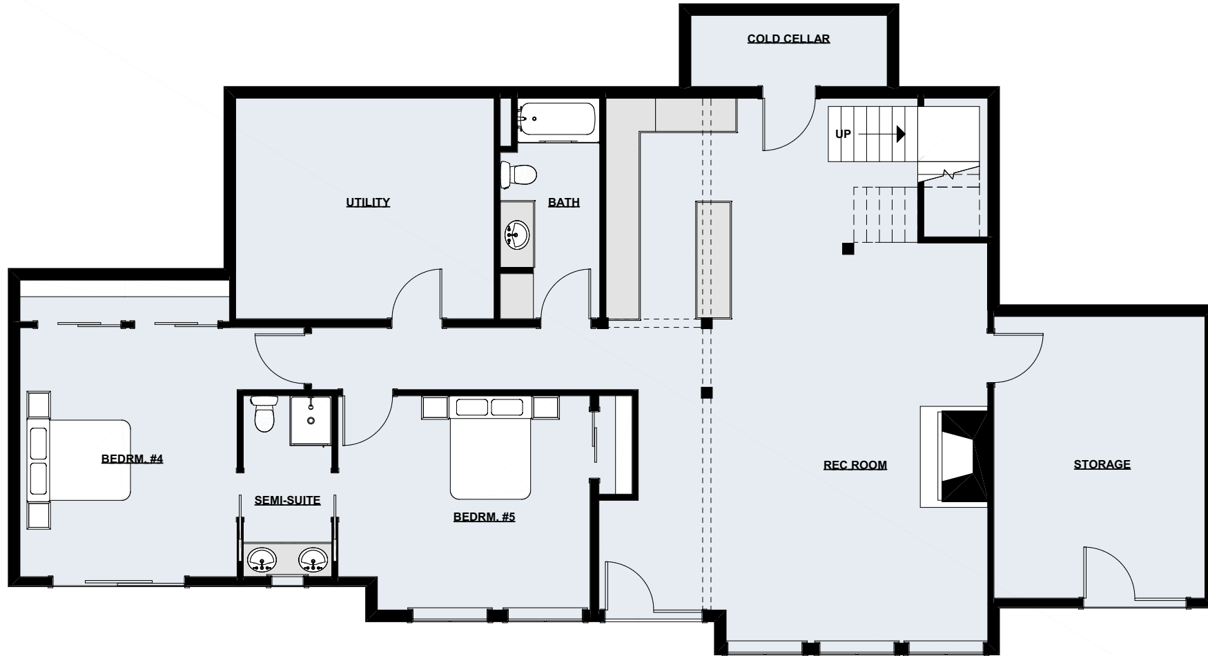
Lower Floor Plan | 2,053 sq ft