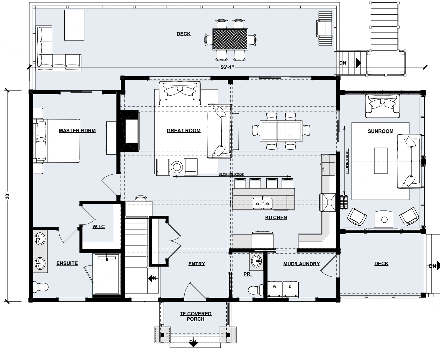
Main Floor Plan | 1,573 sq ft