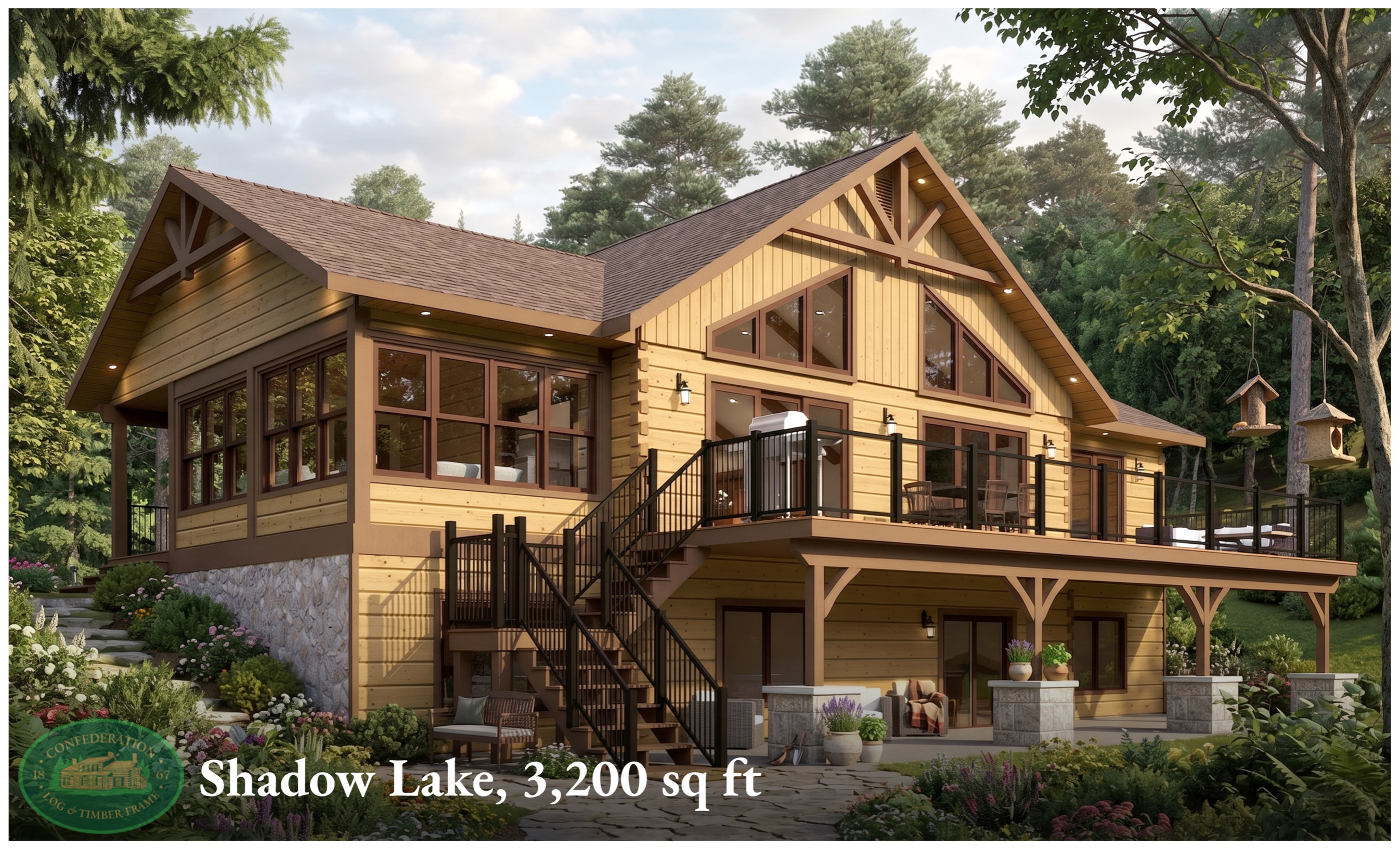
Shadow Lake, 3,200 sq ft