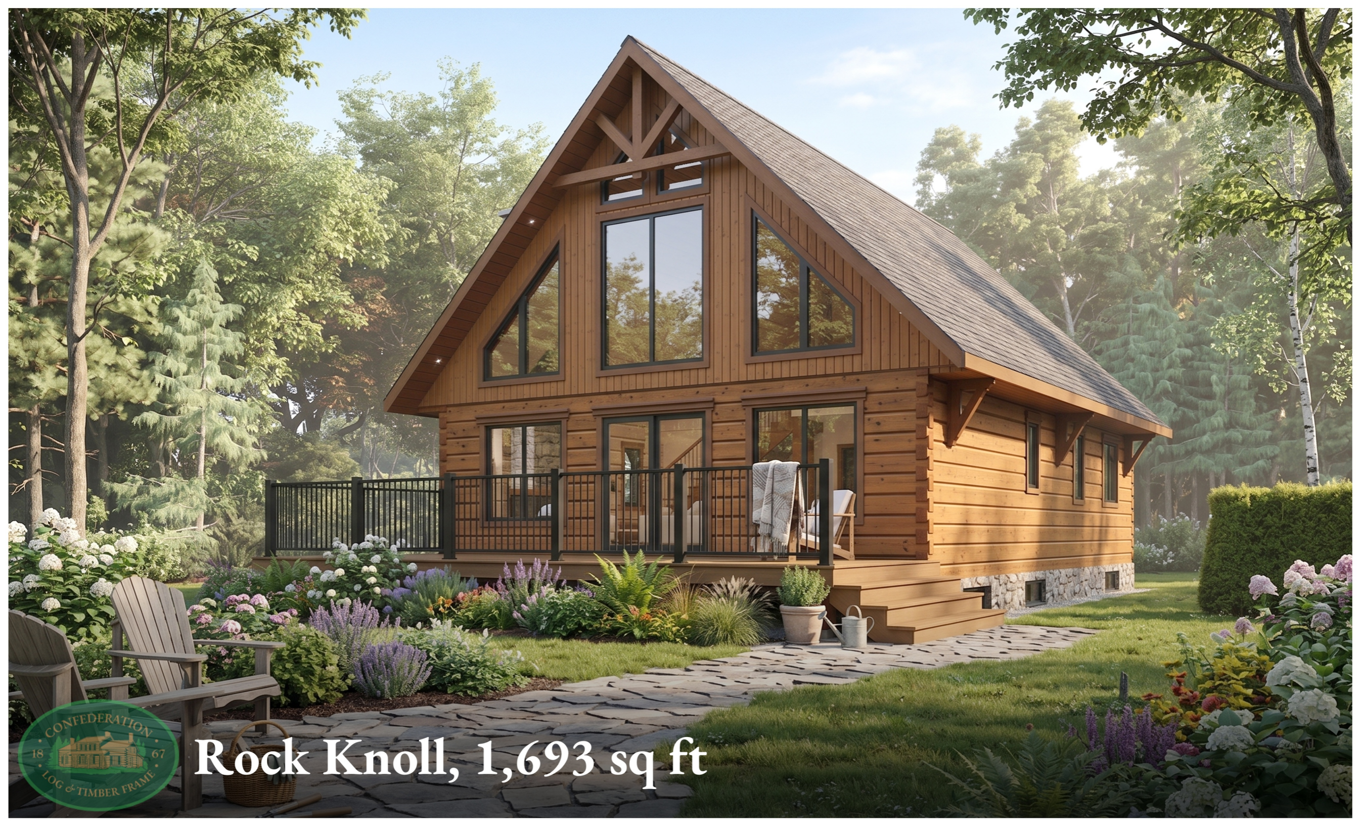
Rock Knoll, 1,693 sq ft