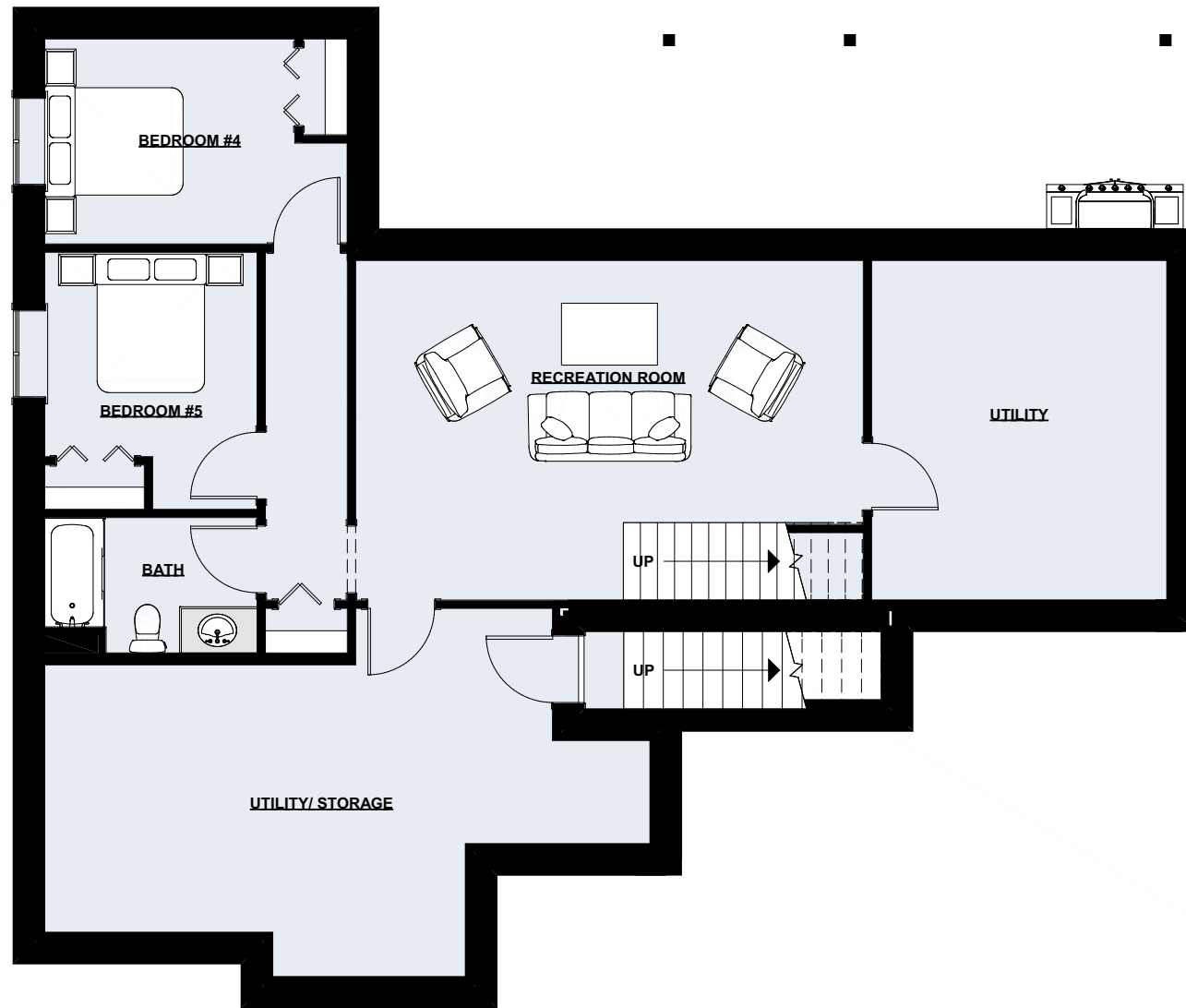
Lower Floor Plan | 1,512 sq ft