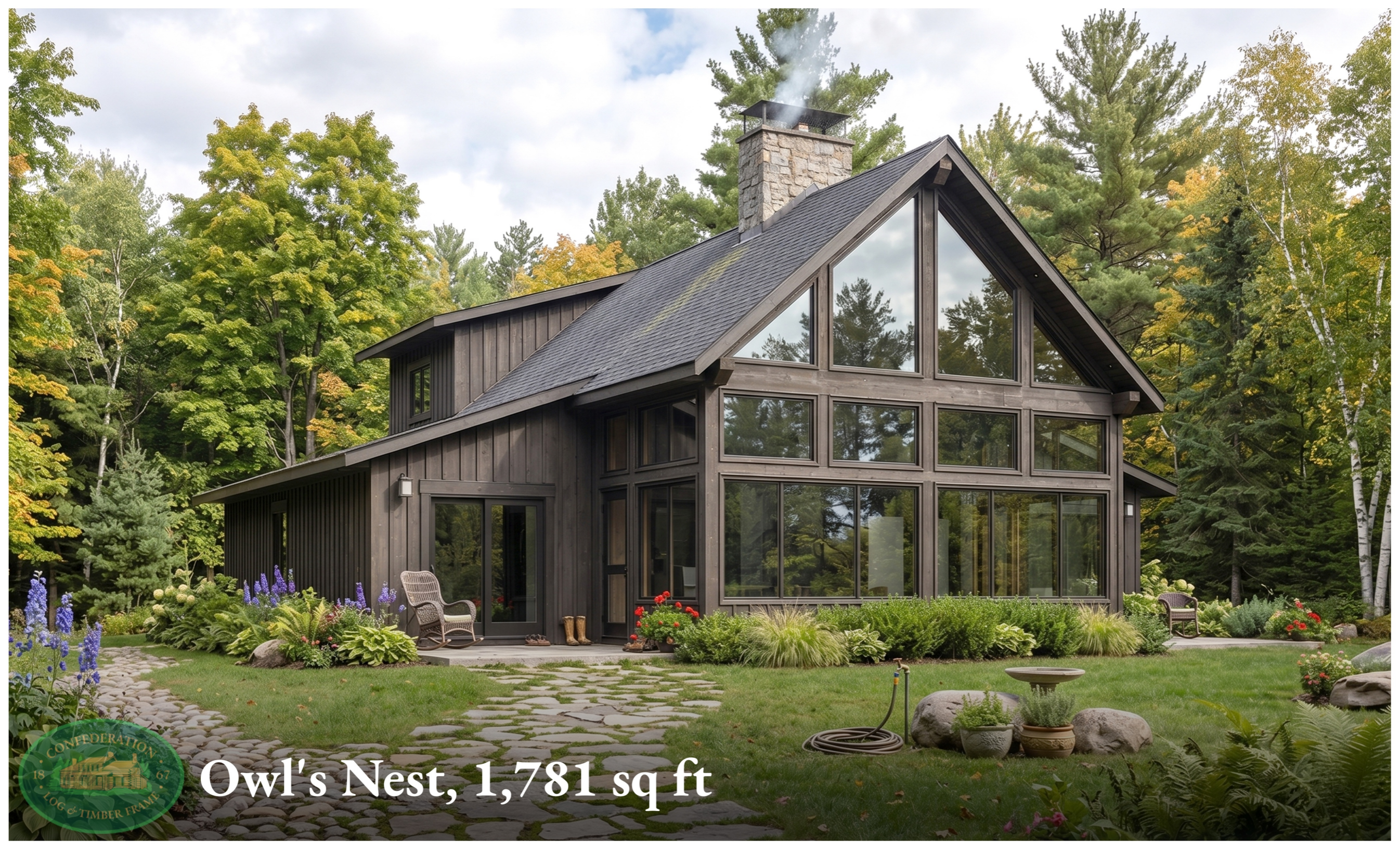
Owl's Nest, 1,781 sq ft