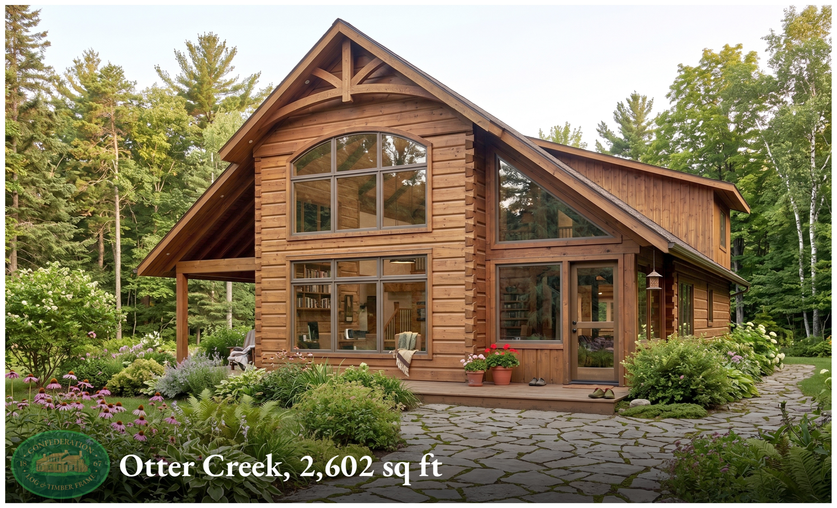
Otter Creek, 2,602 sq ft