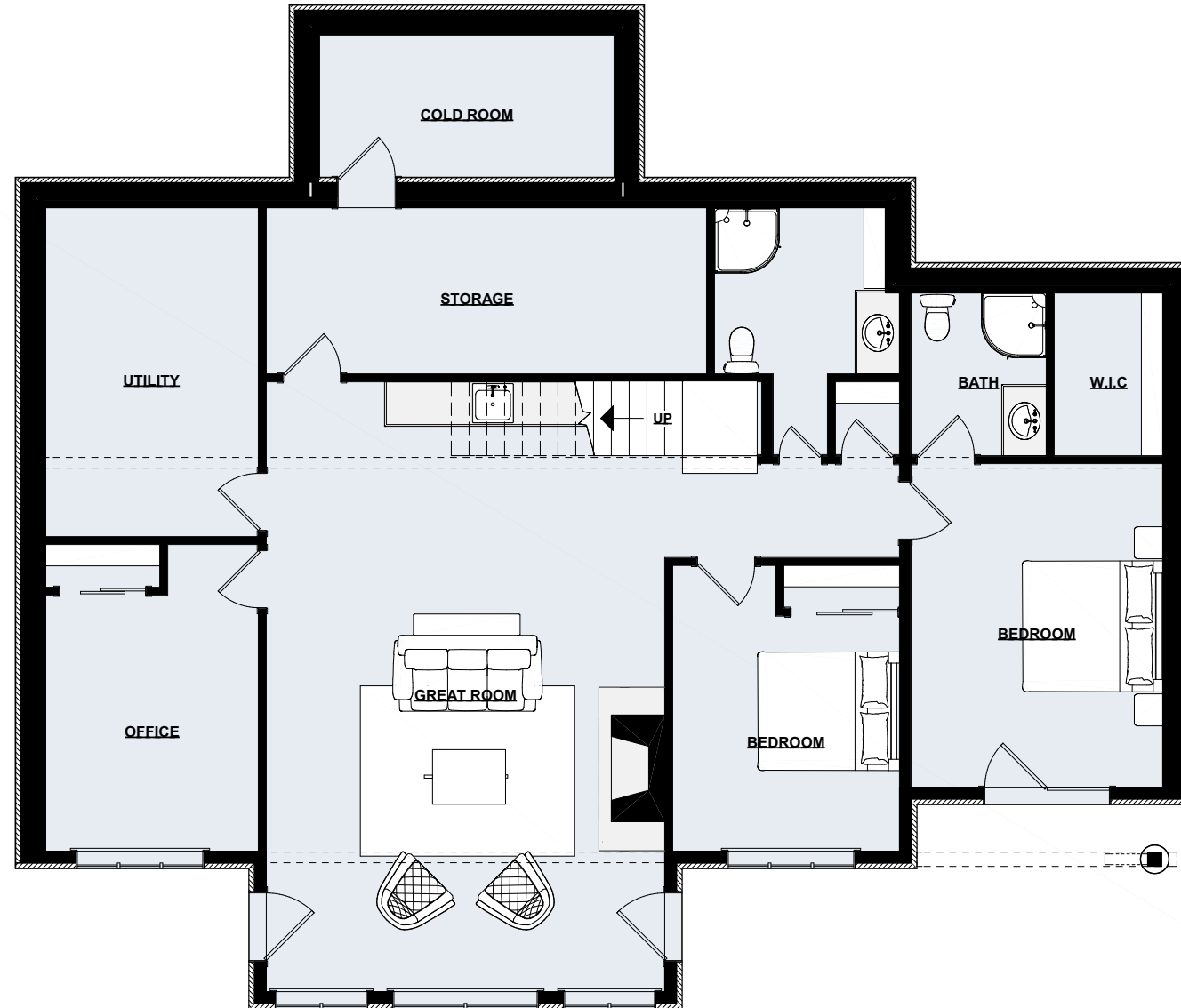
Lower Floor Plan | 1,964 sq ft