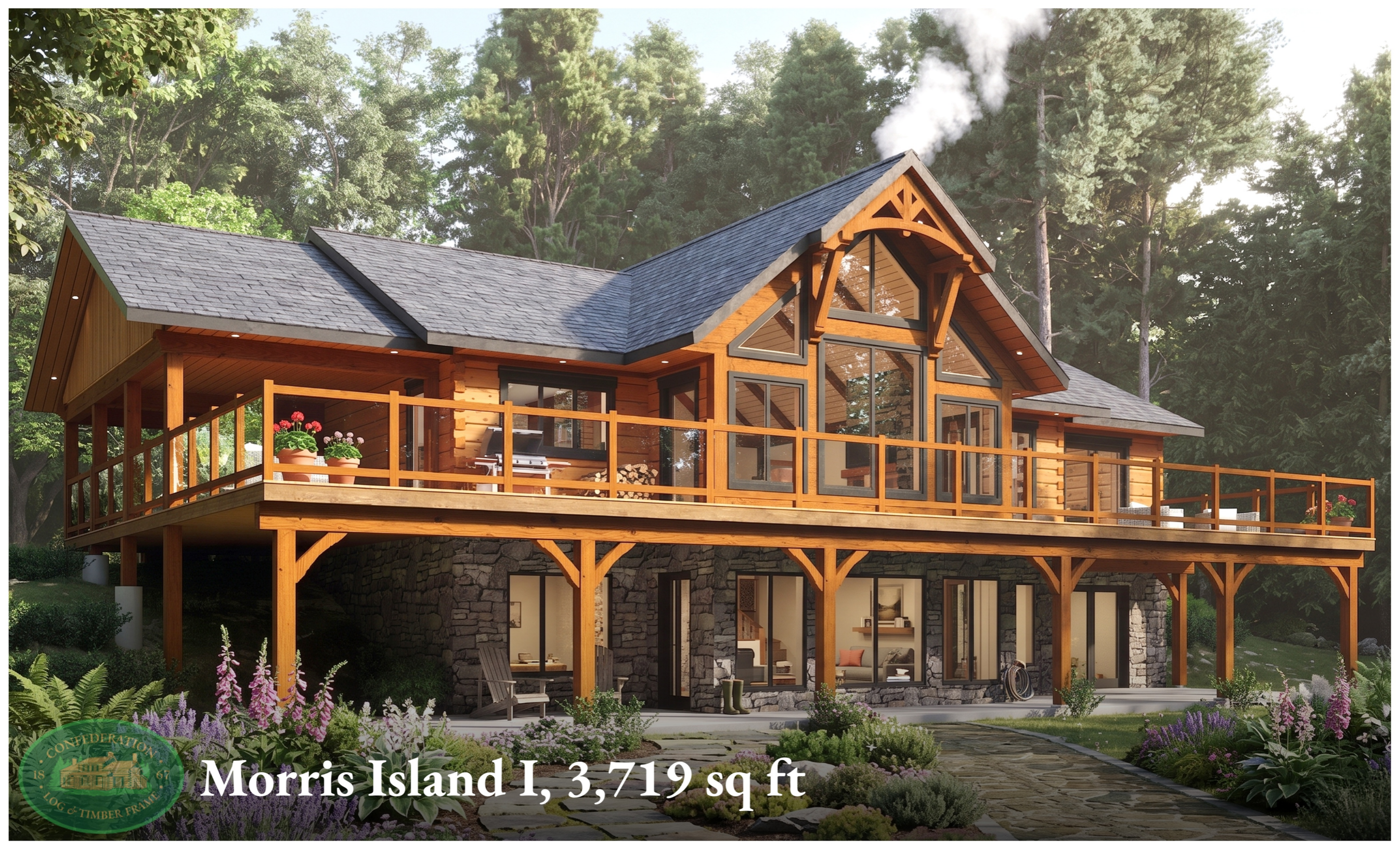
Morris Island I, 3,719 sq ft