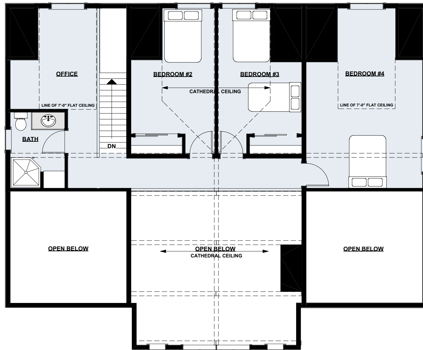
Upper Floor Plan | 937 sq ft