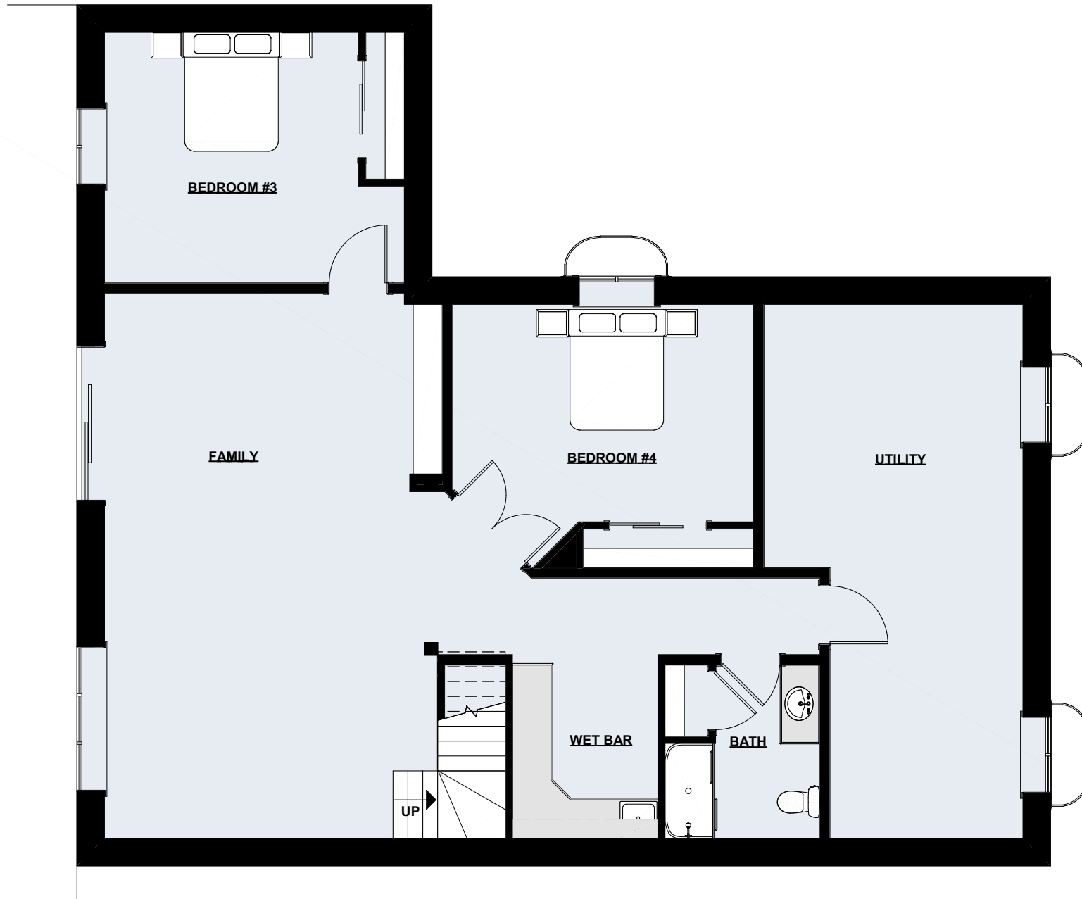
Lower Floor Plan | 1,750 sq ft