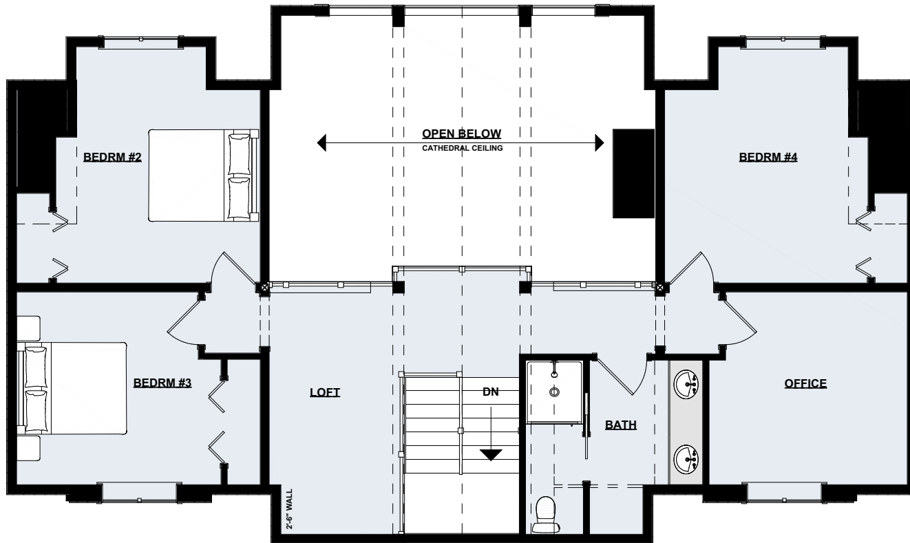
Upper Floor Plan | 1,147 sq ft