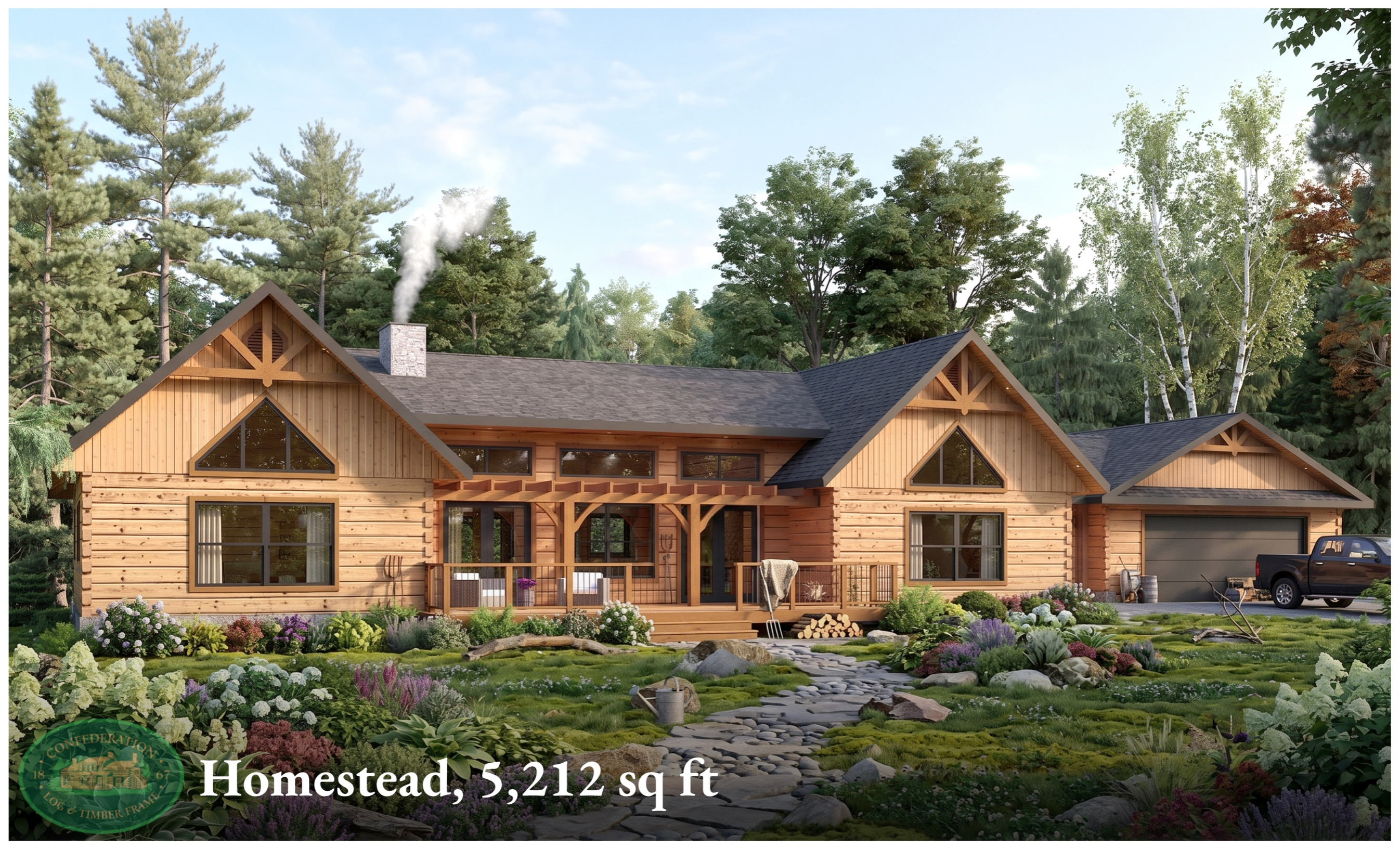
Homestead, 5,212 sq ft