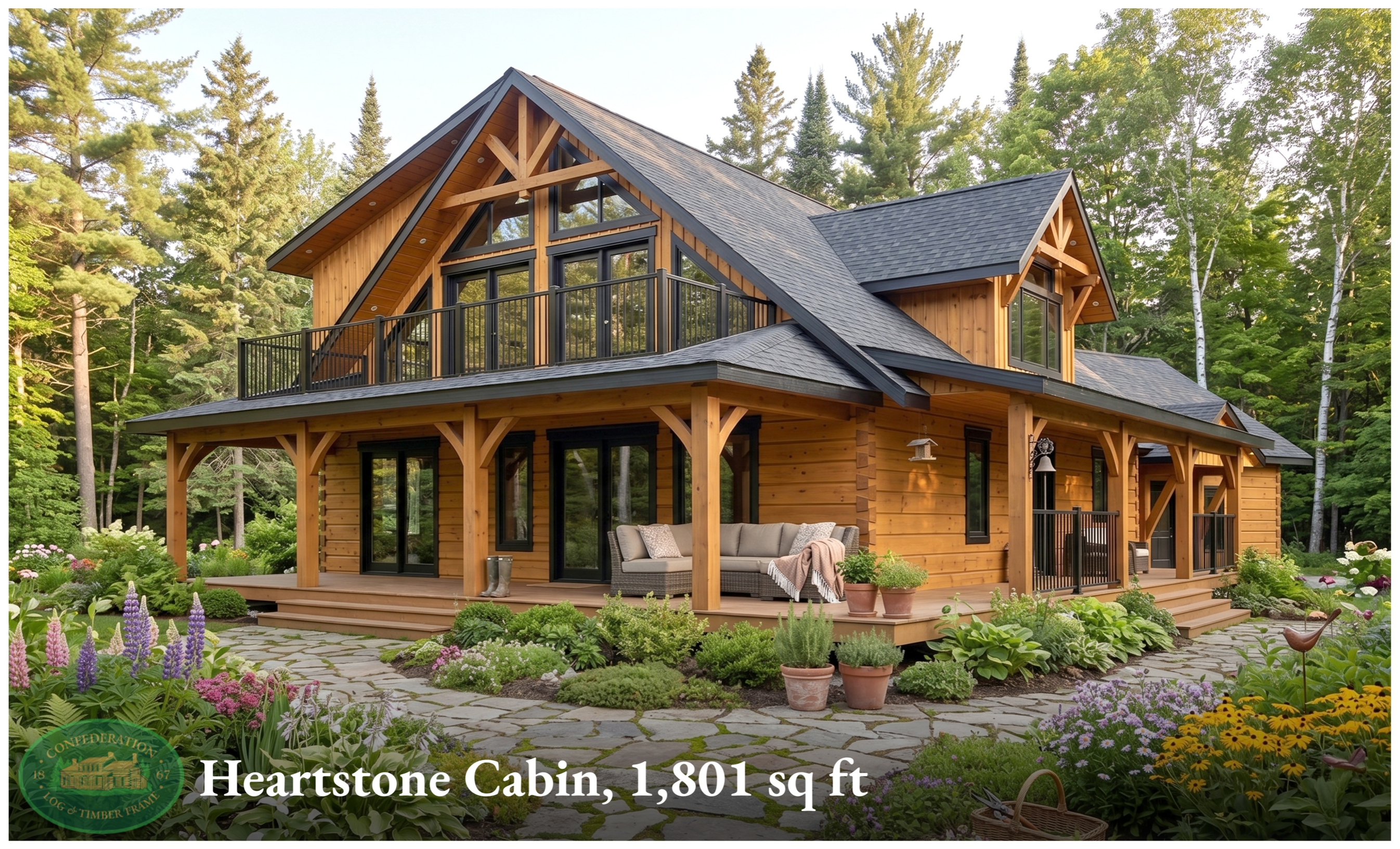
Heartstone Cabin, 1,801 sq ft