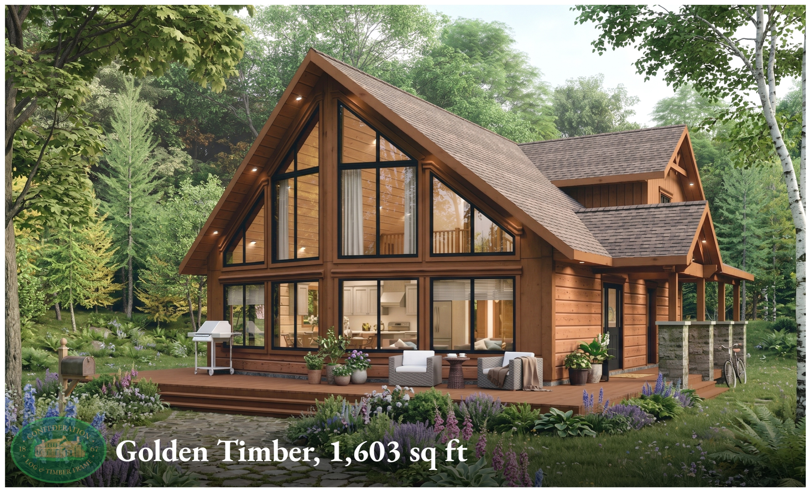
Golden Timber, 1,603 sq ft