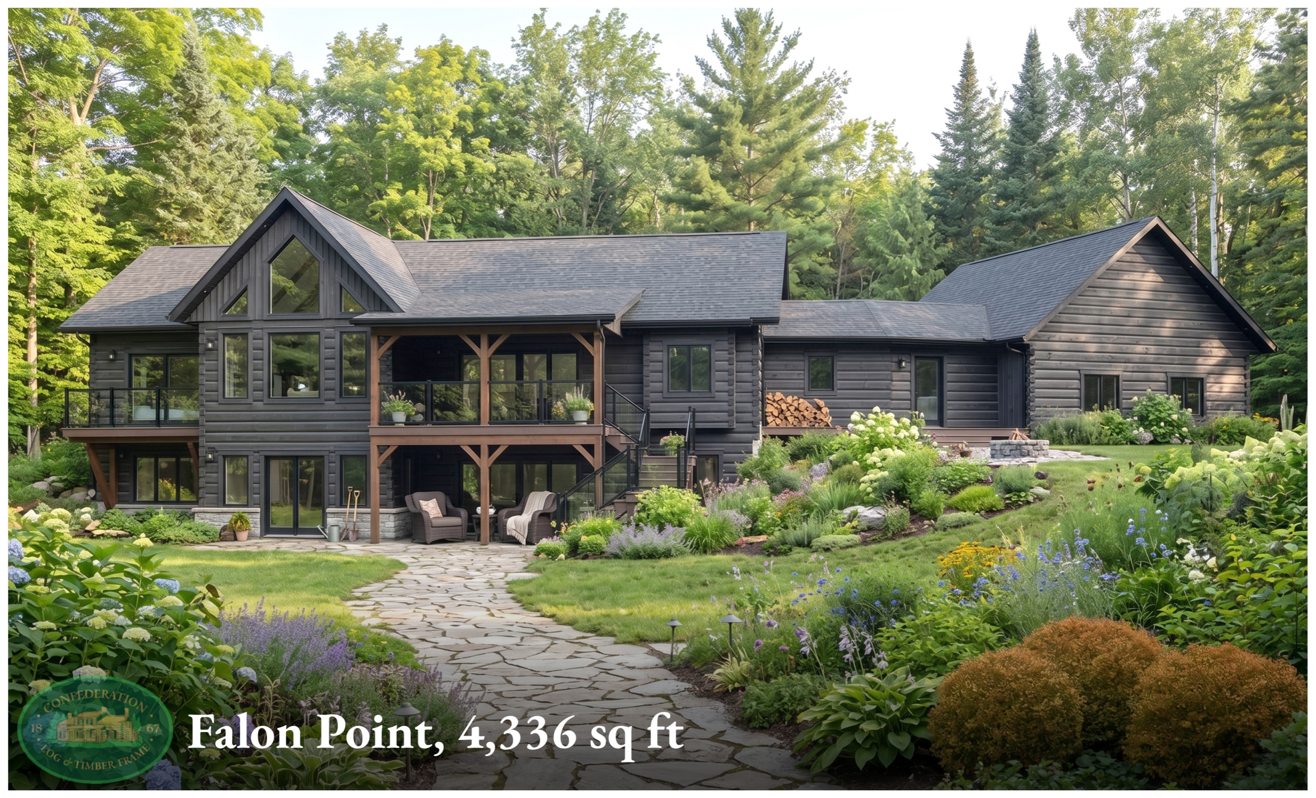
Falon Point, 4,336 sq ft