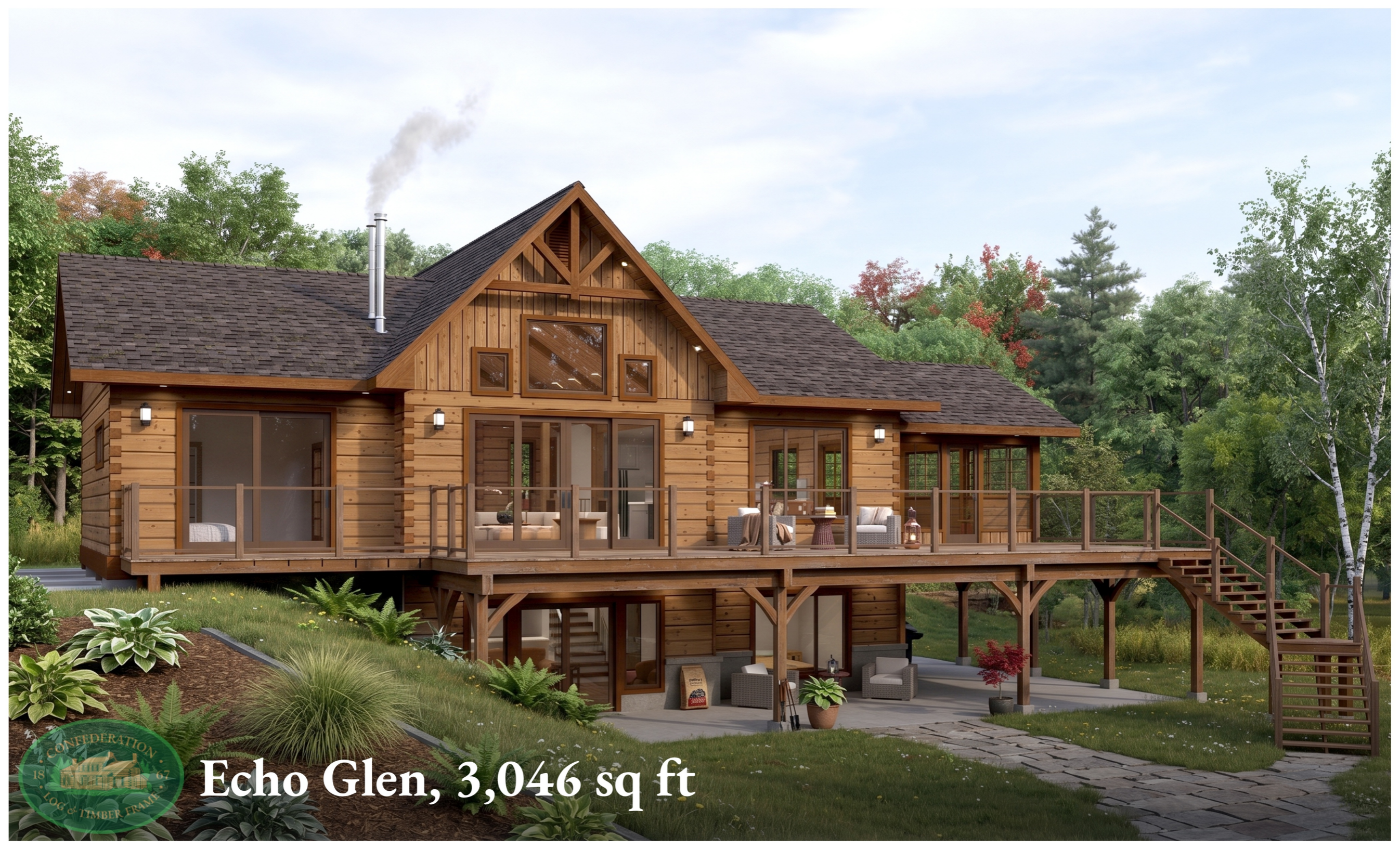
Echo Glen, 3,046 sq ft