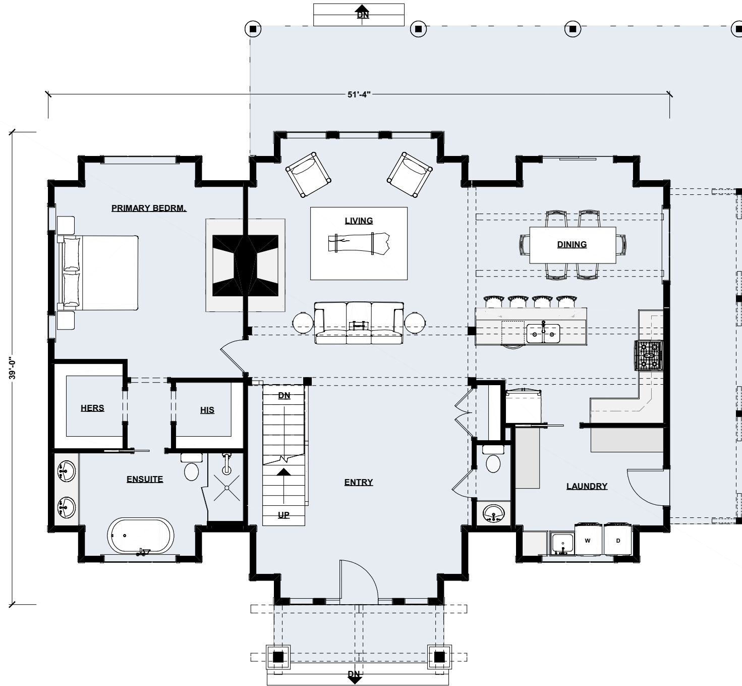
Main Floor Plan | 1710 sq ft