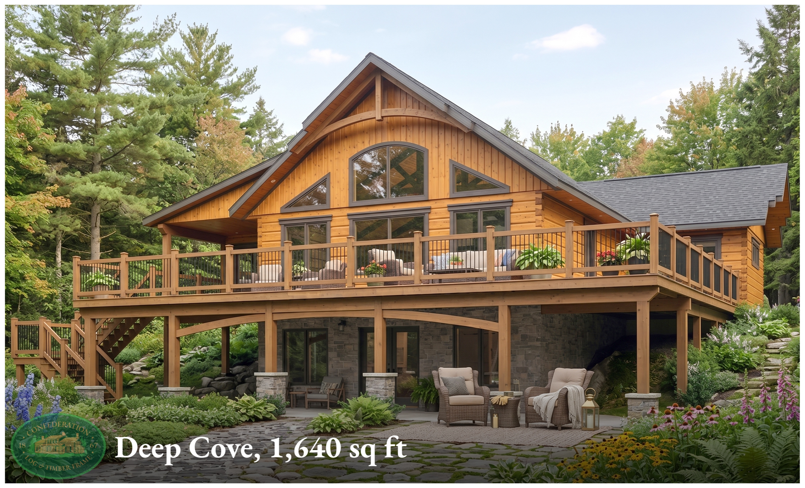
Deep Cove, 1,640 sq ft