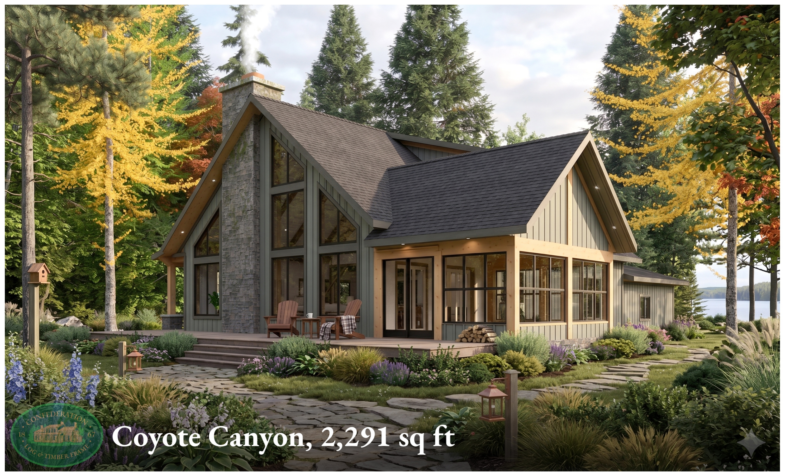
Coyote Canyon, 2,291 sq ft