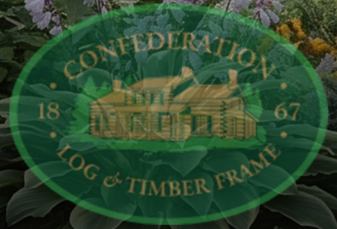
Cedar Ridge, 1,900 sq ft