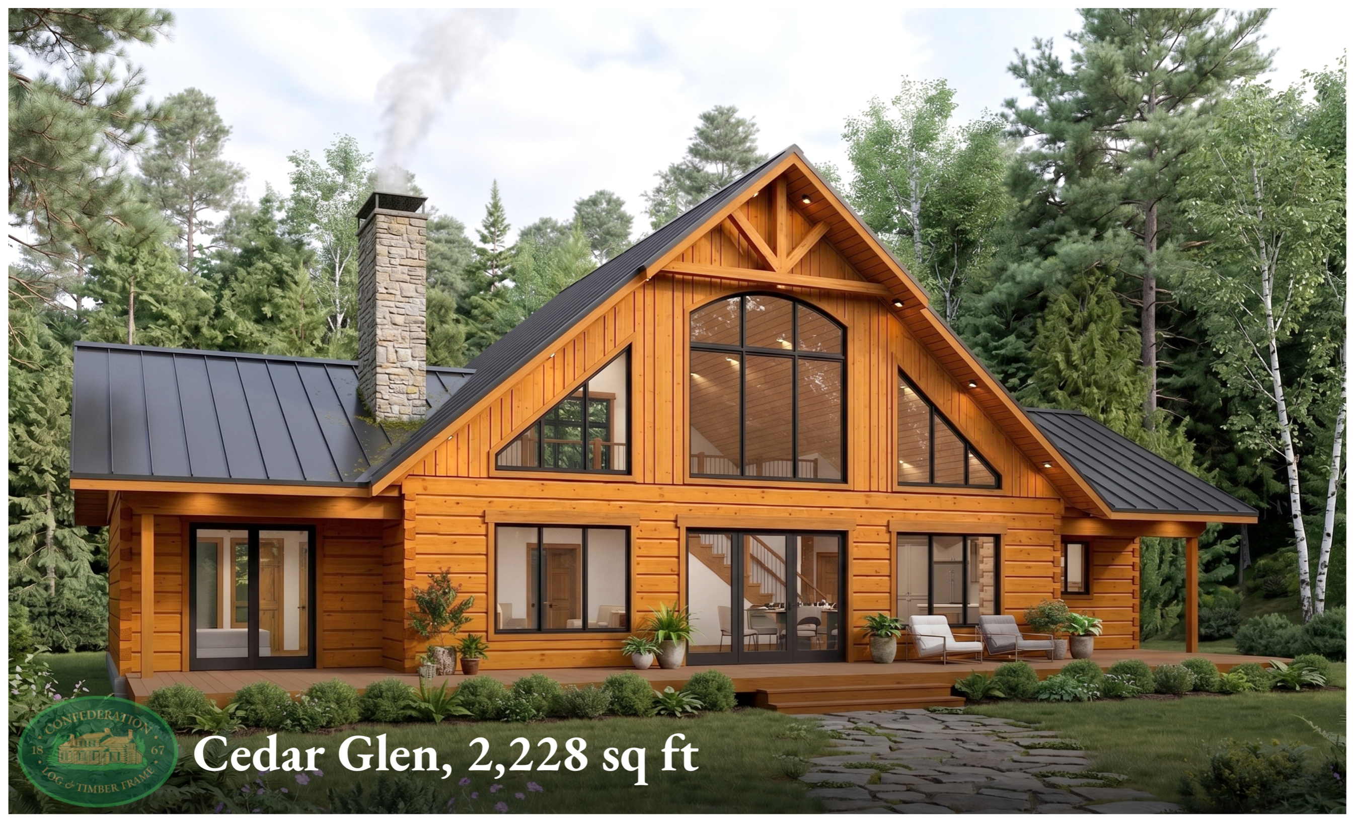
Cedar Glen, 2,228 sq ft