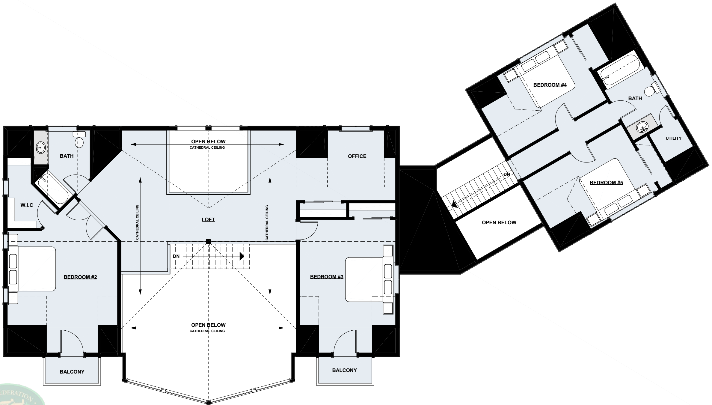
Upper Floor Plan | 1,755 sq ft