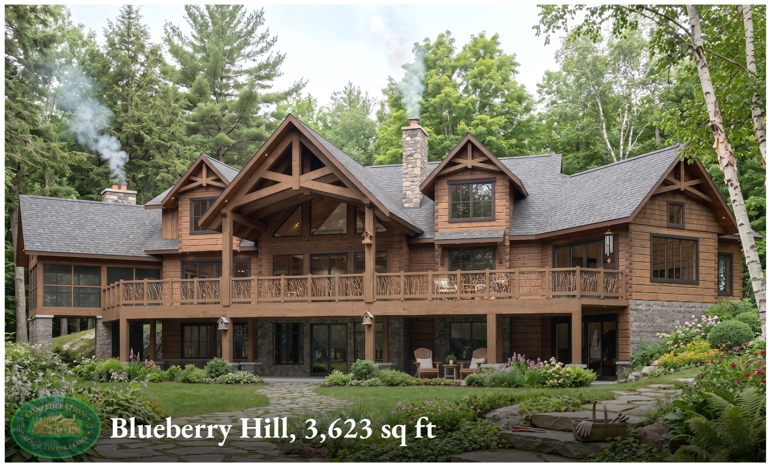
Blueberry Hill, 3,623 sq ft