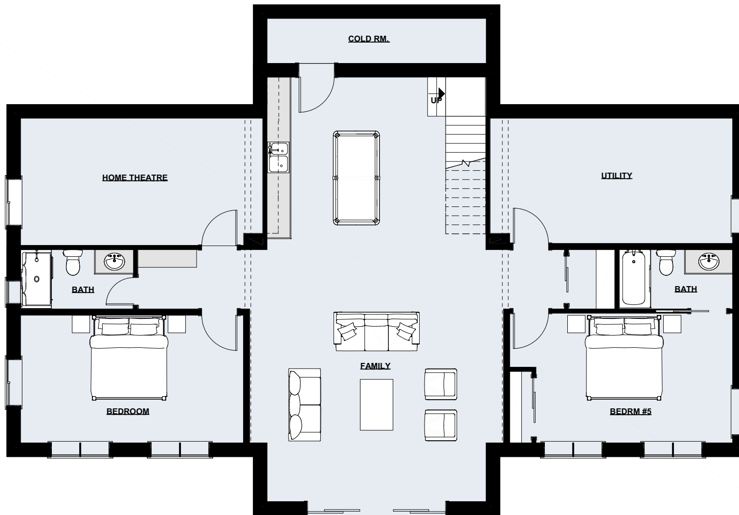
Lower Floor Plan | 2,010 sq ft