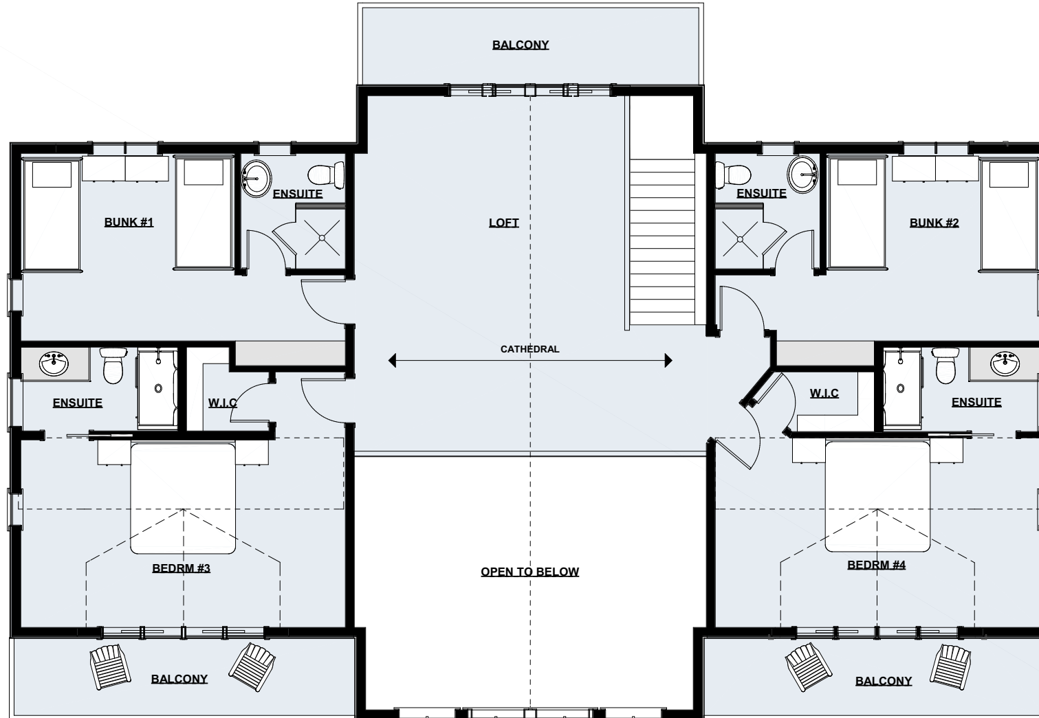
Upper Floor Plan | 1,661 sq ft