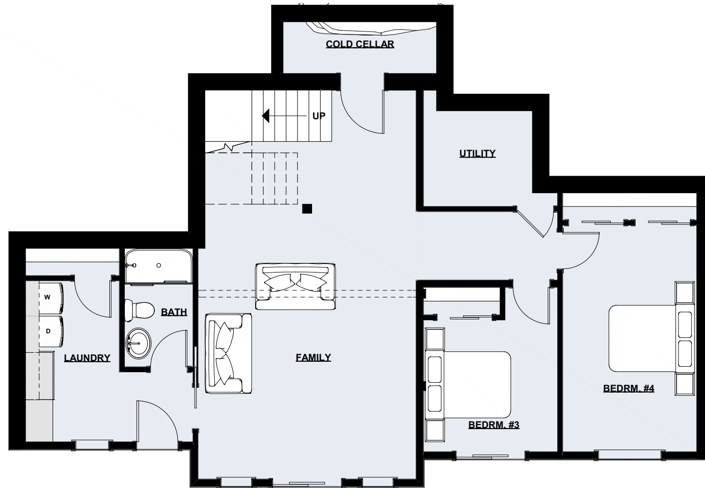
Lower Floor Plan | 1,268 sq ft