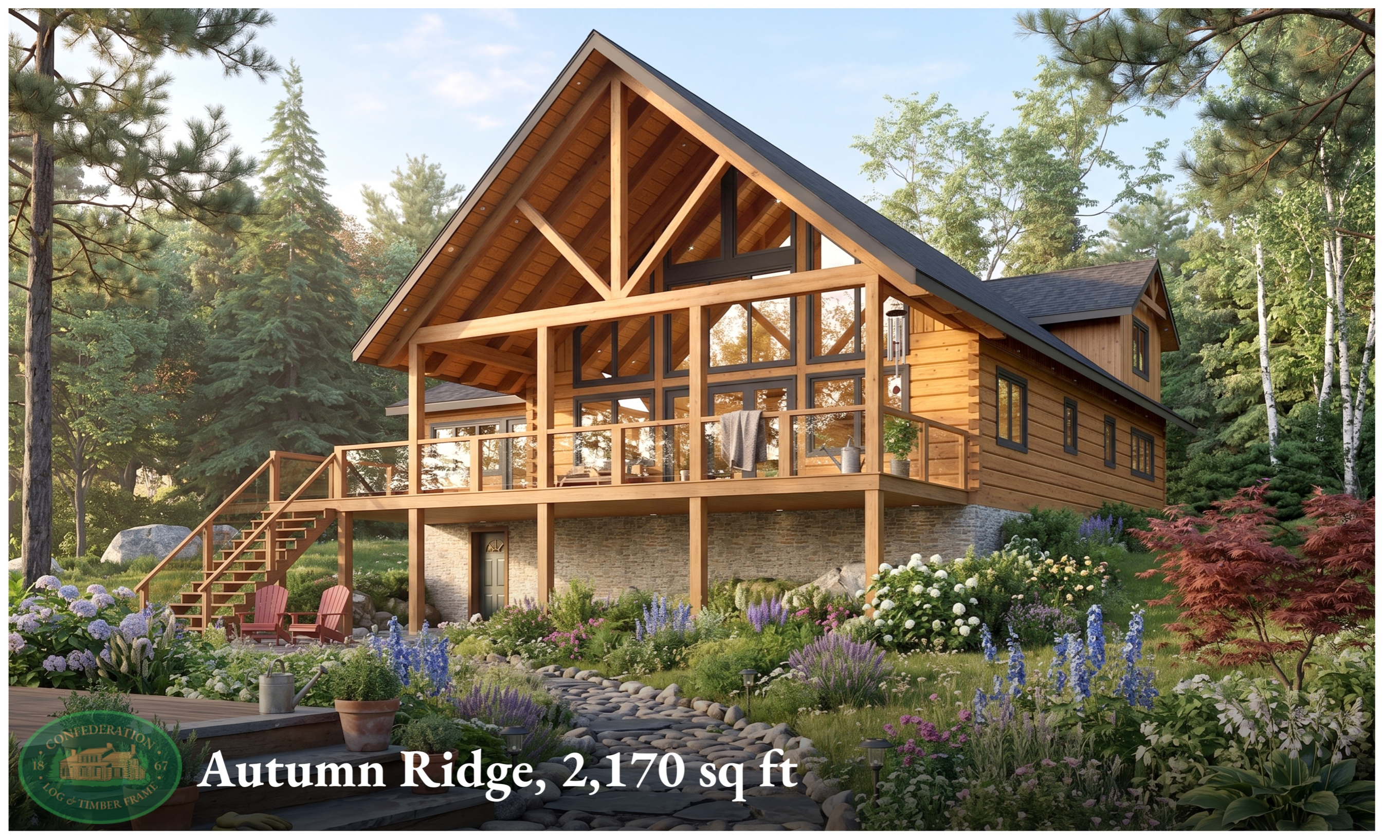
Autumn Ridge, 2,170 sq ft