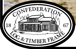
SUMMER KISS - 2127 sq.ft