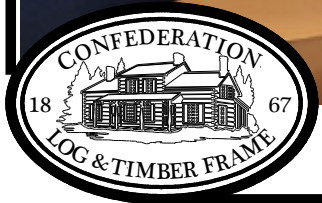
MUSKOKA II - 1683 sq.ft