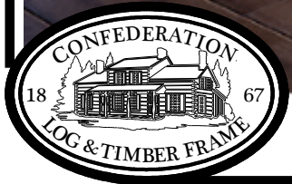
MUSKOKA II - 1683 sq.ft