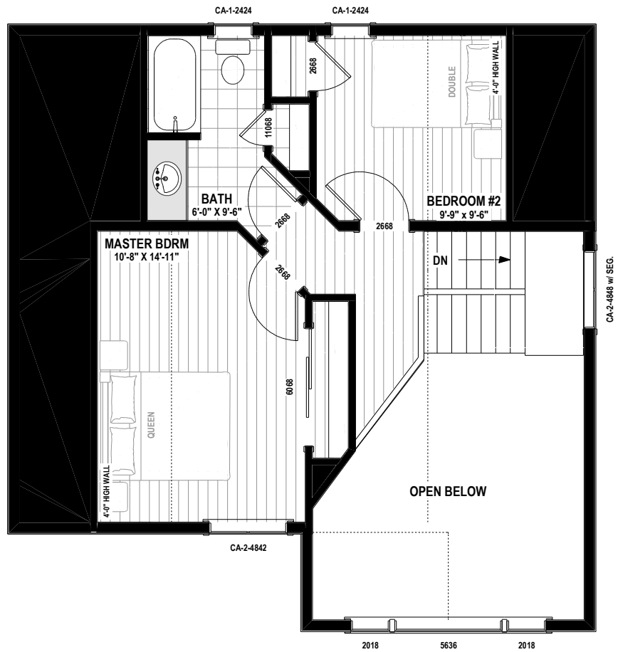
UPPER FLOOR PLAN 616 SQ.FT