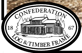
MUSKOKA II - 1683 sq.ft