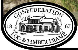
HILLCREST III - 2349 sq.ft