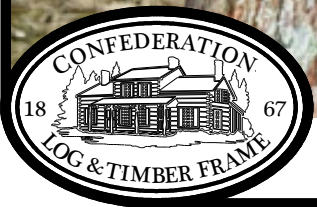
HILLCREST III - 2349 sq.ft