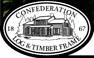
Timber Lane II - 1554 SQ.FT