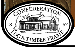
Timber Lane II - 1554 SQ.FT