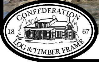
Timber Lane II - 1554 SQ.FT