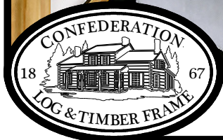
Timber Lane II - 1554 SQ.FT