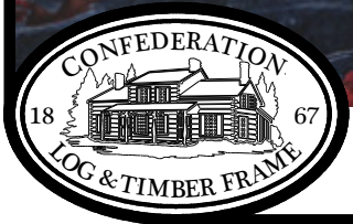
TALL PINES - 3516 sq.ft