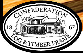
CAMBRIDGE II - 1530 sq.ft