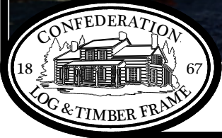
ALPINE II - 1296 sq.ft