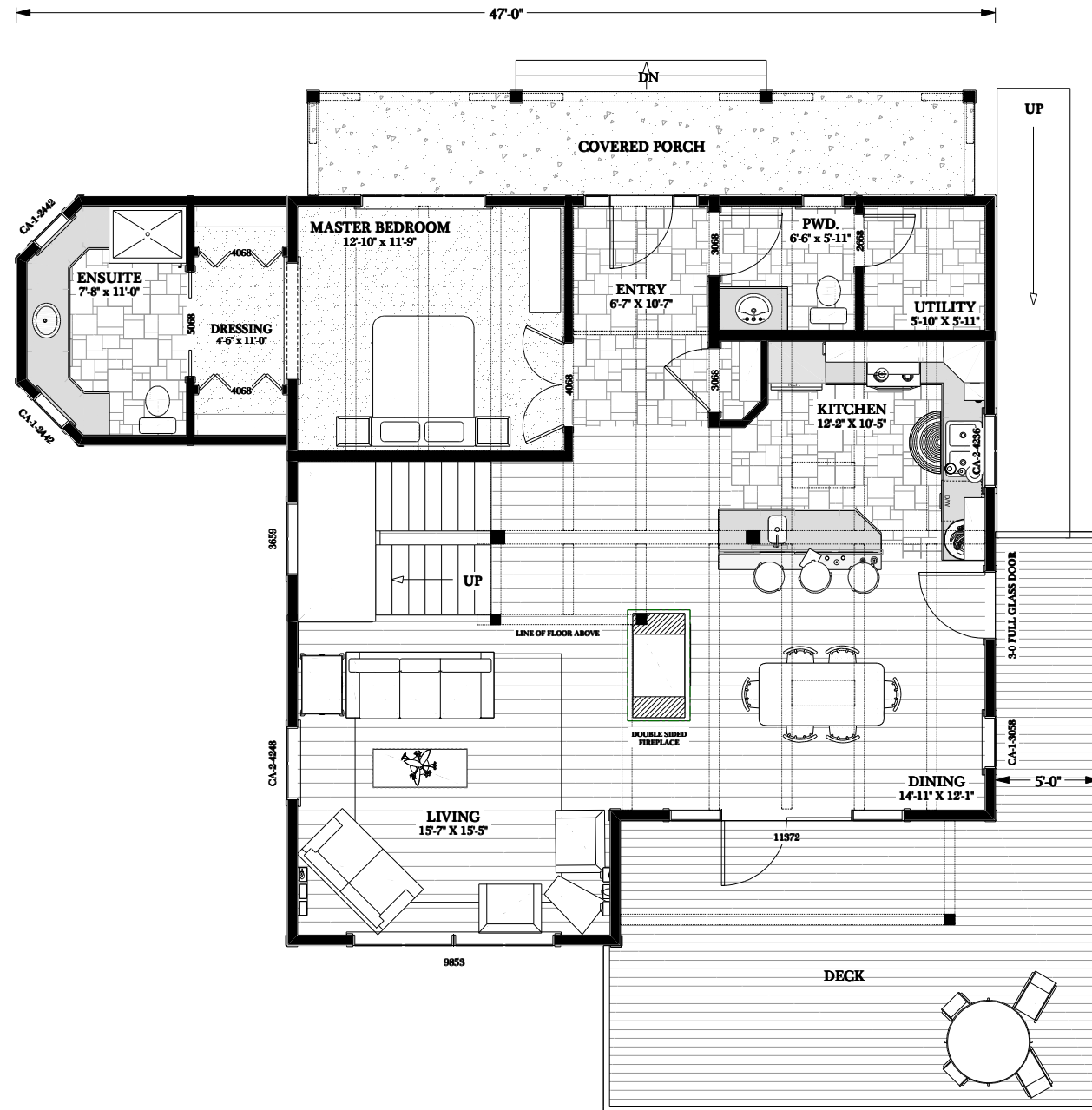
MAIN FLOOR PLAN 1262 SQ.FT