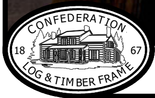
GATINEAU HILLS- 1785 sq.ft