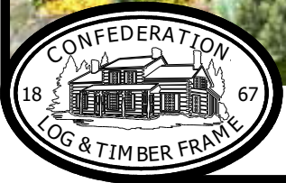
GATINEAU HILLS- 1785 sq.ft