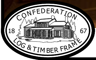
GATINEAU HILLS- 1785 sq.ft