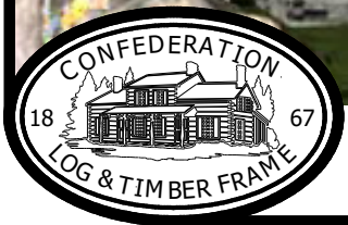
GATINEAU HILLS- 1785 sq.ft