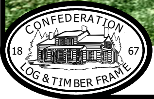
FIDDLEHEAD - 1348 sq.ft