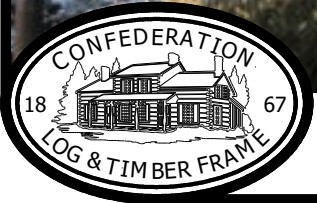
TWIN PEAKS - 1527 sq.ft