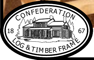
TWIN PEAKS - 1527 sq.ft