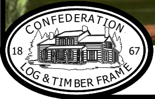
PURPLE FINCH - 2011 sq.ft